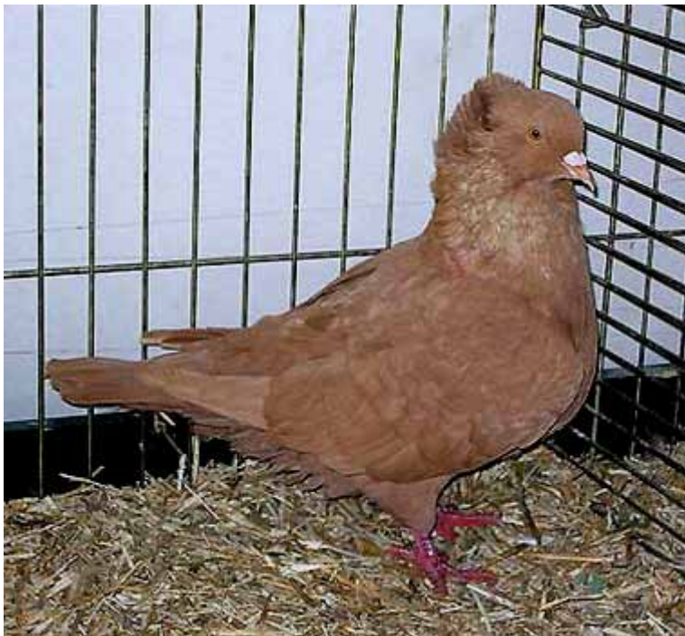
Left: Another Red Sottobanca, with an outstanding head and crest.