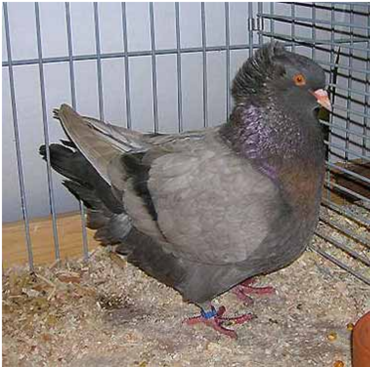
Left: Note the ochre coloured fleck at the breast, this must be a (dark barred) blue dilute Sottobanca.