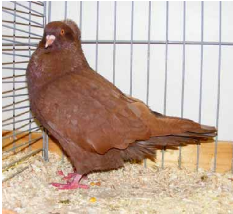
Right: A Red Sottobanca with a good crest.