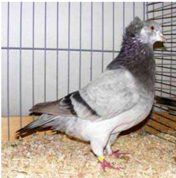
Left: A Blue Grizzle Sottobanca of Raymond Daalmans; the shell crest could be a bit better and the eye ceres a little more red. Note the grizzle colour marking, causing white feather patches on the head.