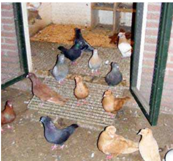
Left: Although it was dark the Sottobancas readily came outside when we were taking photos. Here we see the Sottobanca in black, red, yellow, gold, black barred, blue dilute dark barred and cream.

During the breeding season they get an additional added feed of Hope Farm P-40 pellets, mainly to give the youngsters something extra. According to Raymond this helps them to grow up evenly and prevents crooked breastbones; a thing that frequently occurs in (rather) heavy utility breeds like this one.