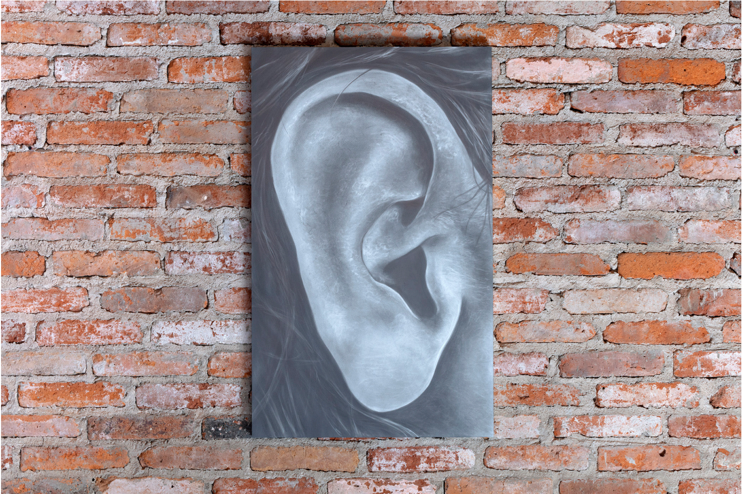
Juan Antonio Olivares Untitled (right ear) , 2023 Acrylic and graphite on aluminum panel 60.9 x 100.8 x 2.5 cm 24 x 39.75 x 1 in