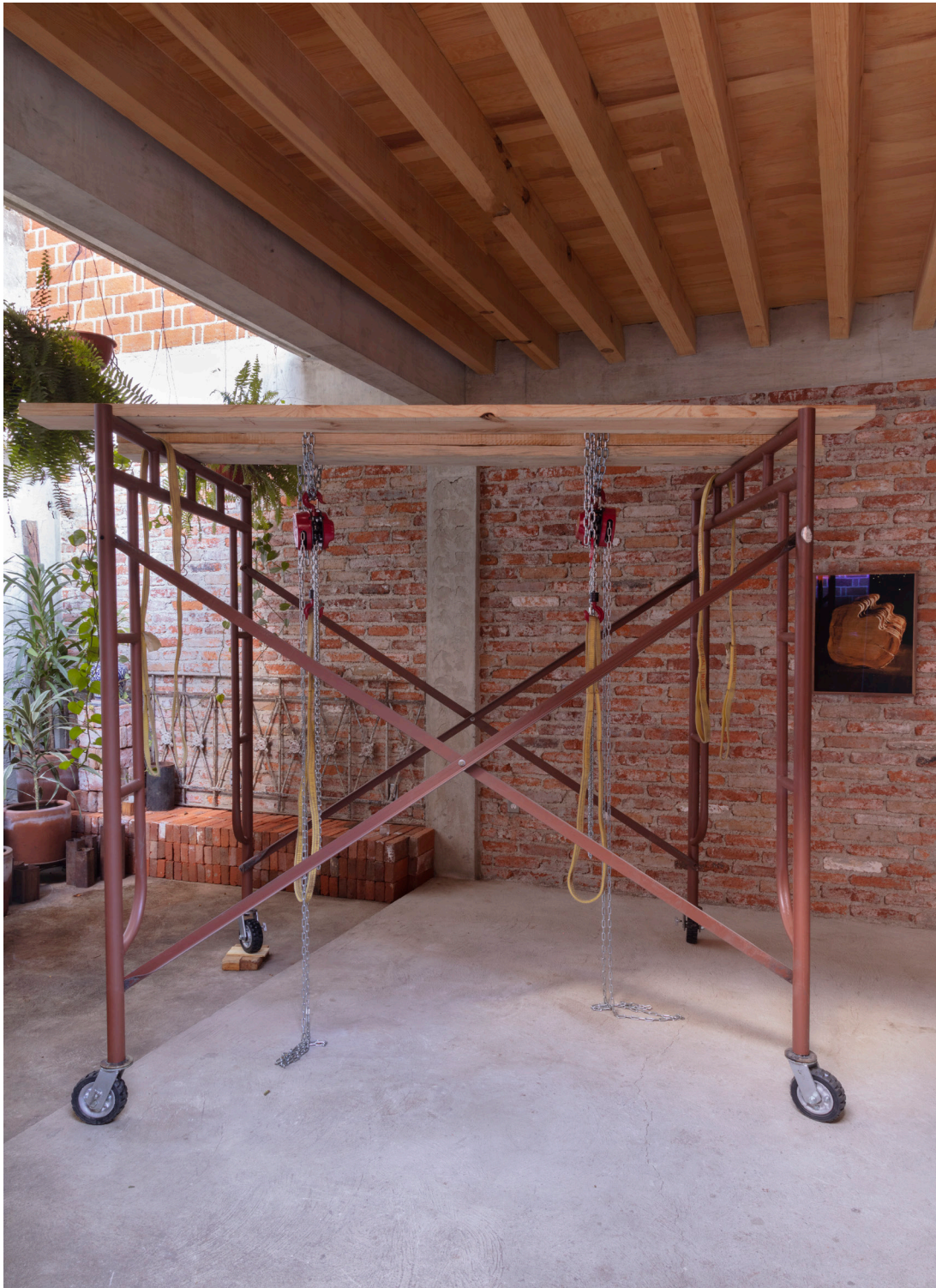
Joseph Grigely Support Structure , 2023 Scaffolding, chains, hoists, wood, slings. 228 x 149.8 x 203 cm 90 in x 59 x 80 in