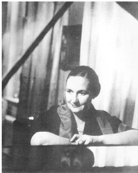
Fig. 7: Gina Bachauer (Graham Wade)

Bachauer, whose portrait is given below (see Fig. 7), demonstrated innate virtuosity from an early age. The programme of her solo debut recital in Paris in 1929 consisted of three extremely virtuosic pieces: Brahms's Variations on a Theme of Paganini , Liszt's Rhapsodie Espagnol and Ravel's Gaspard de la Nuit . 149