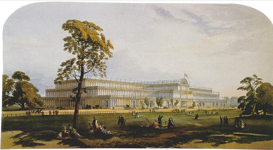
(Fig 1: Crystal Palace, Hyde Park: northeast side from Dickinson's Comprehensive Pictures of the Great Exhibition of 1851 published in 1854)

fashionable and ‘popular’ opera in the summer of 1856. However, Grove Music Online states that ‘the orchestral concerts were far more important in pioneering new repertory and raising performance standards’. 98 Manns’ orchestra, with the support of George Grove, became one of the best orchestras in Europe in the 1860s. 99 But the reputation of the Crystal Palace Orchestra diminished as the twentieth century approached; Manns disbanded his orchestra in 1900.