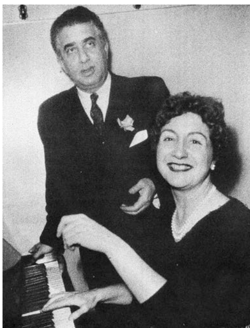
Fig. 9: Moura Lympany with Aram Khachaturian (Moura Lympany: Autobiography)

Once again, Lympany's repertoire, supposedly chosen for the good of Britain during the war, was not German music; furthermore, although she gained a reputation as a virtuoso of Russian music, later in her life she became disenchanted with being pigeon-holed. So, long after the war years, she learned and performed Schoenberg's Six Pieces, Op.19. She says it was received so enthusiastically that it was almost more successful than anything else in her repertoire. 205 However, Lympany's concert and recording programmes consisted of standard repertoire, albeit with Russian virtuosic pieces included.