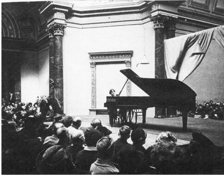
Fig. 4: Myra Hess's recital at the National Gallery Concerts