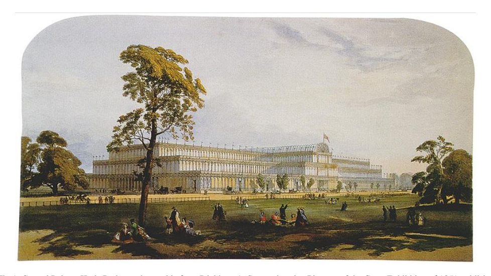
(Fig 1: Crystal Palace, Hyde Park: northeast side from Dickinson's Comprehensive Pictures of the Great Exhibition of 1851 published in 1854)

fashionable and 'popular' opera in the summer of 1856. However, Grove Music Online states that 'the orchestral concerts were far more important in pioneering new repertory and raising performance standards'.<sup>98</sup> Manns' orchestra, with the support of George Grove, became one of the best orchestras in Europe in the 1860s.<sup>99</sup> But the reputation of the Crystal Palace Orchestra diminished as the twentieth century approached; Manns disbanded his orchestra in 1900.