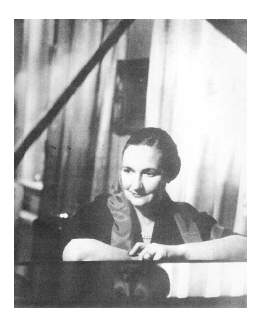
Fig. 7: Gina Bachauer (Graham Wade)

Bachauer, whose portrait is given below (see Fig. 7), demonstrated innate virtuosity from an early age. The programme of her solo debut recital in Paris in 1929 consisted of three extremely virtuosic pieces: Brahms's Variations on a Theme of Paganini , Liszt's Rhapsodie Espagnol and Ravel's Gaspard de la Nuit .<sup>149</sup>