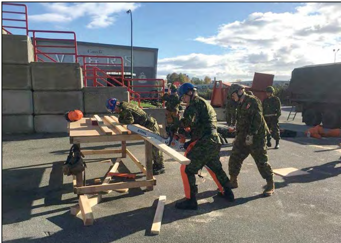
LUSAR training conducted at VFRS TF-1 training centre.

The year ended with a LUSAR crse ran by 15 Fd Regt, with assistance from Vancouver Fire & Rescue Services Task-Force 1 (VFRS TF-1) by allowing us to use their training site for practical work.