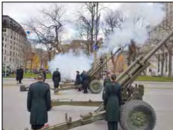
Tir de salut Jour du Souvenir / Gun Salute Remembrance Day, Downtown Montréal Centre-ville, 11 nov 18, 2nd Fd Regt.