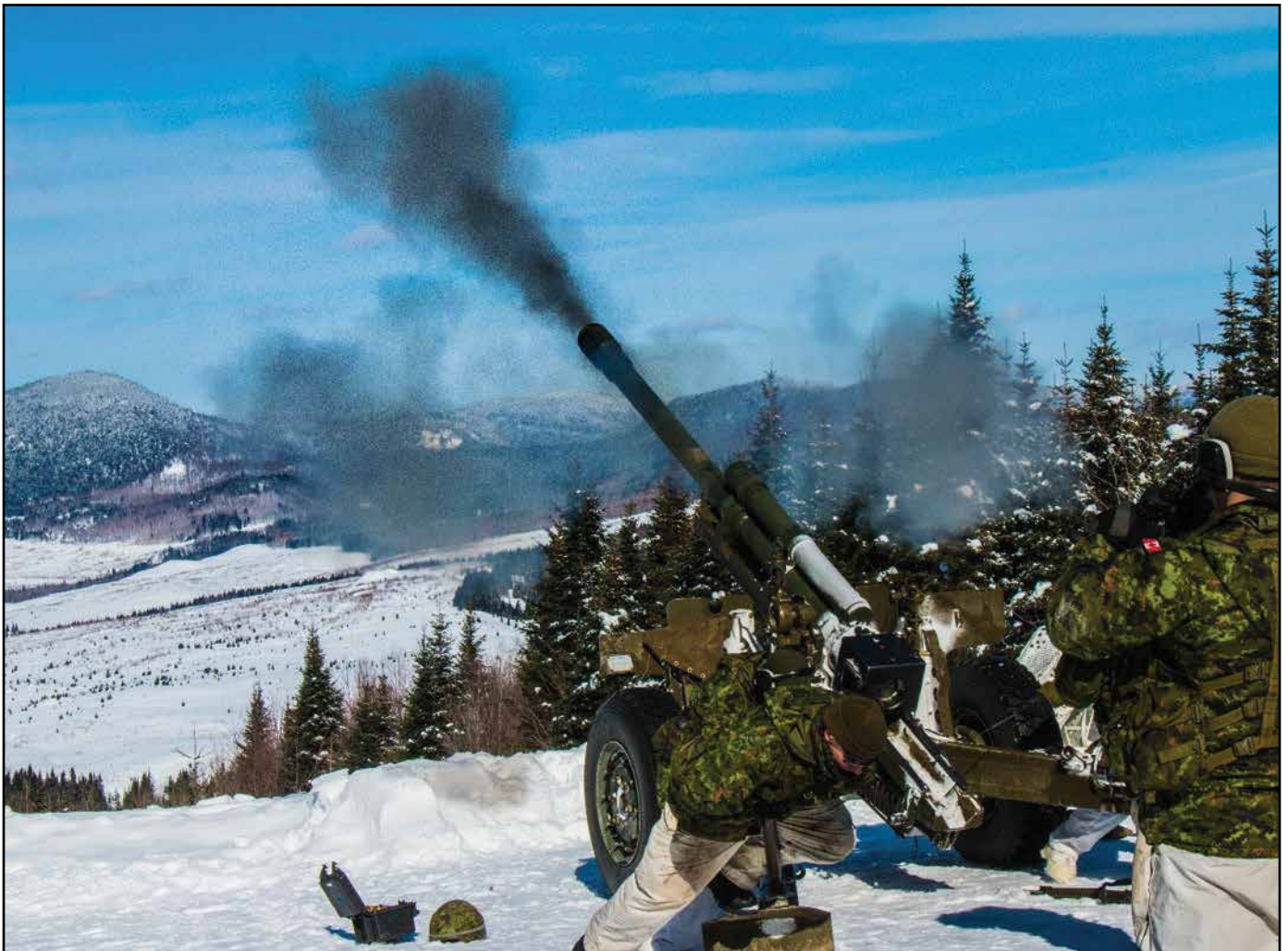
Mission de tir avec le C3 105mm pendant un exercice de tir réel à la BFC Valcartier février 2018. Fire mission with 105mm C3 during live fire exercise at CFB Valcartier february 2018.