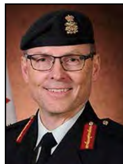
BGEN K.R. COTTEN