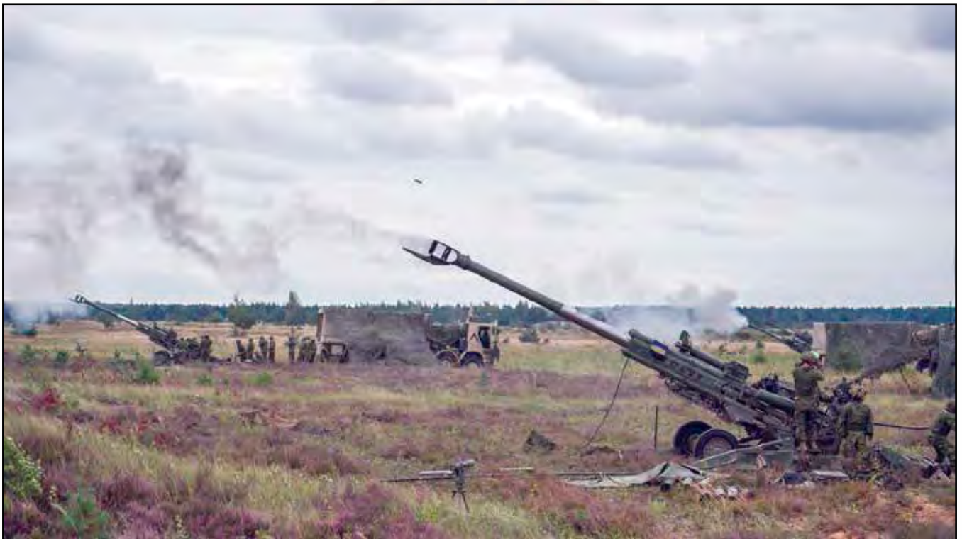
E Bty conducts field firing during Op REASSURANCE while deployed to Latvia during the summer of '18.