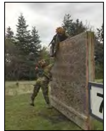
Members of 5 (BC) Fd Regt, RCA conducting the obstacle course at CFB Esquimalt.