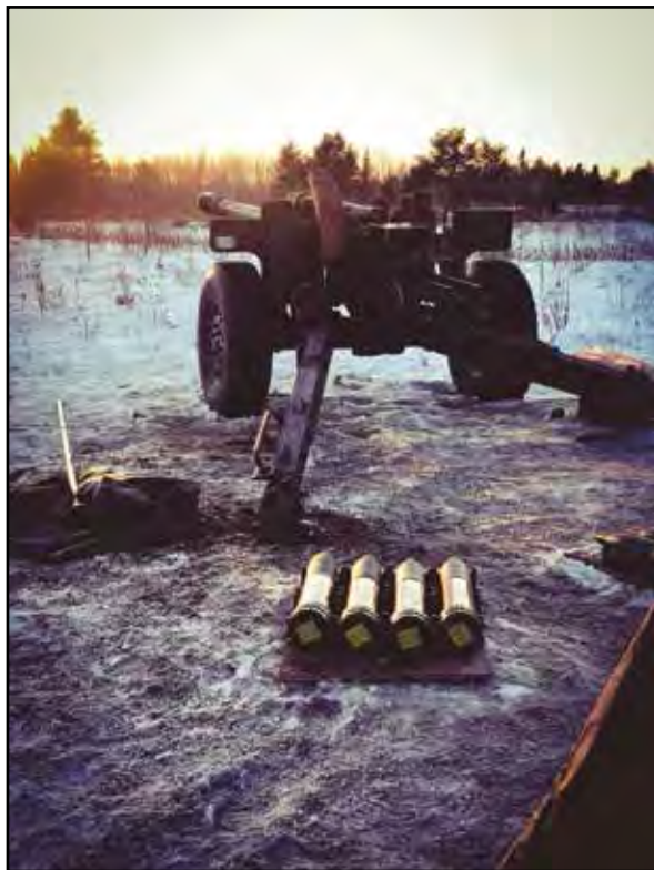
RCAS photo contest submission titled "REST".

I am honoured to be your Senior Serving Gunner. Please join me in working diligently to grow our next generation to be better than we ever were and to advance the interests of the Royal Canadian Regiment of Artillery.