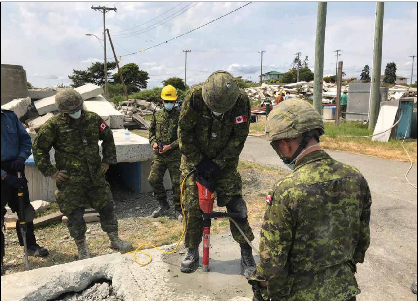
Dirty breaching on the LUSAR course at CFB Esquimalt, BC.