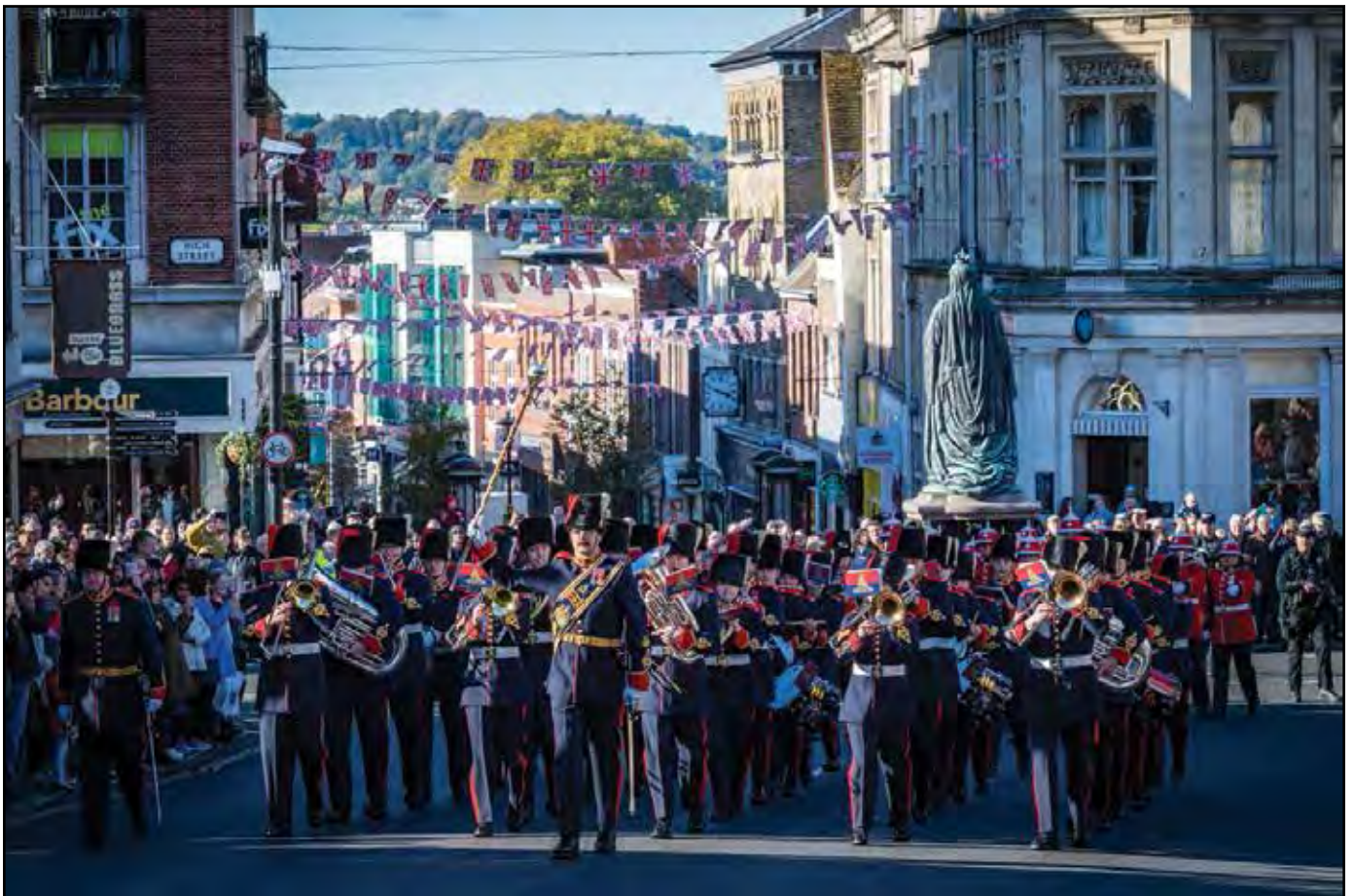
The Royal Canadian Artillery Band march from Victoria Barracks to Windsor Castle during the Mounting of the Queen's Guard at Windsor Castle in the Royal Borough of Windsor on October 27, 2018.

For more information on the RCA Band, visit our Facebook page link www.facebook.com/RCABand