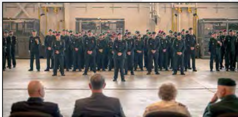
E Bty on parade for 2 RCHA's annual Canoe River Memorial service.