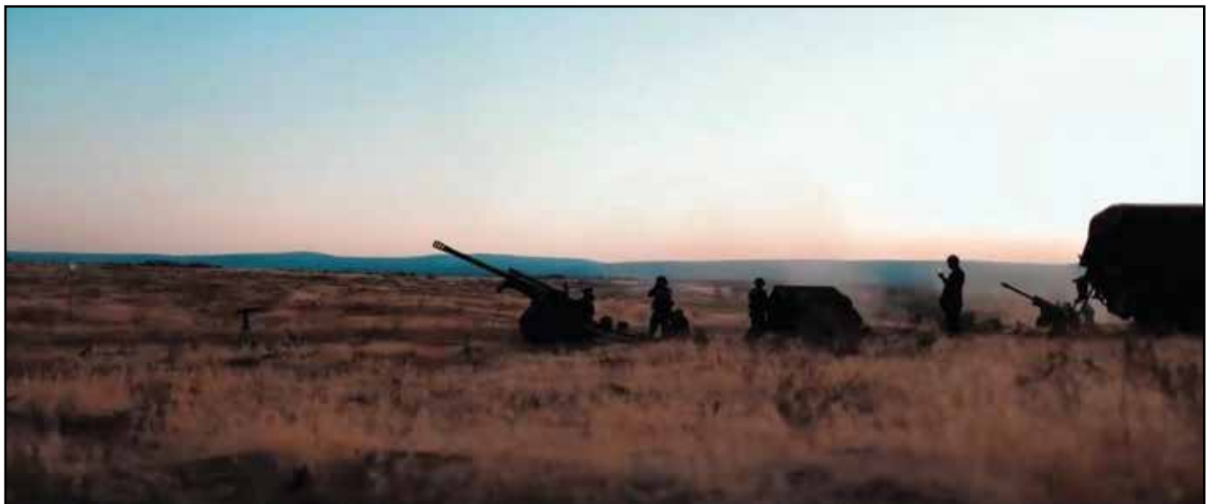
Gunline position in Yakima, WA during Ex CAUSTIC SHOCK II.