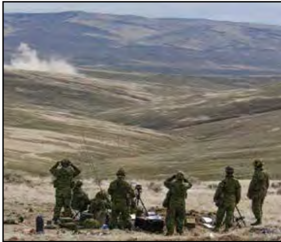
Observation Party on Ex CAUSTIC SHOCK.

5 (BC) Fd Regt, RCA kept an increased tempo between the inter-