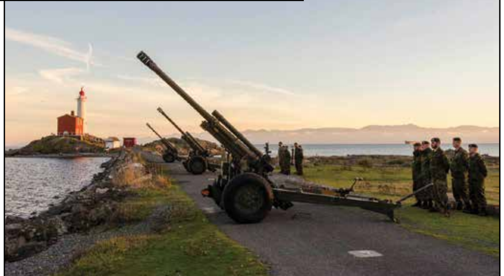
5 (BC) Fd Regt, RCA conducts the Canada Day Gun Salute at Ford Rodd Hill.