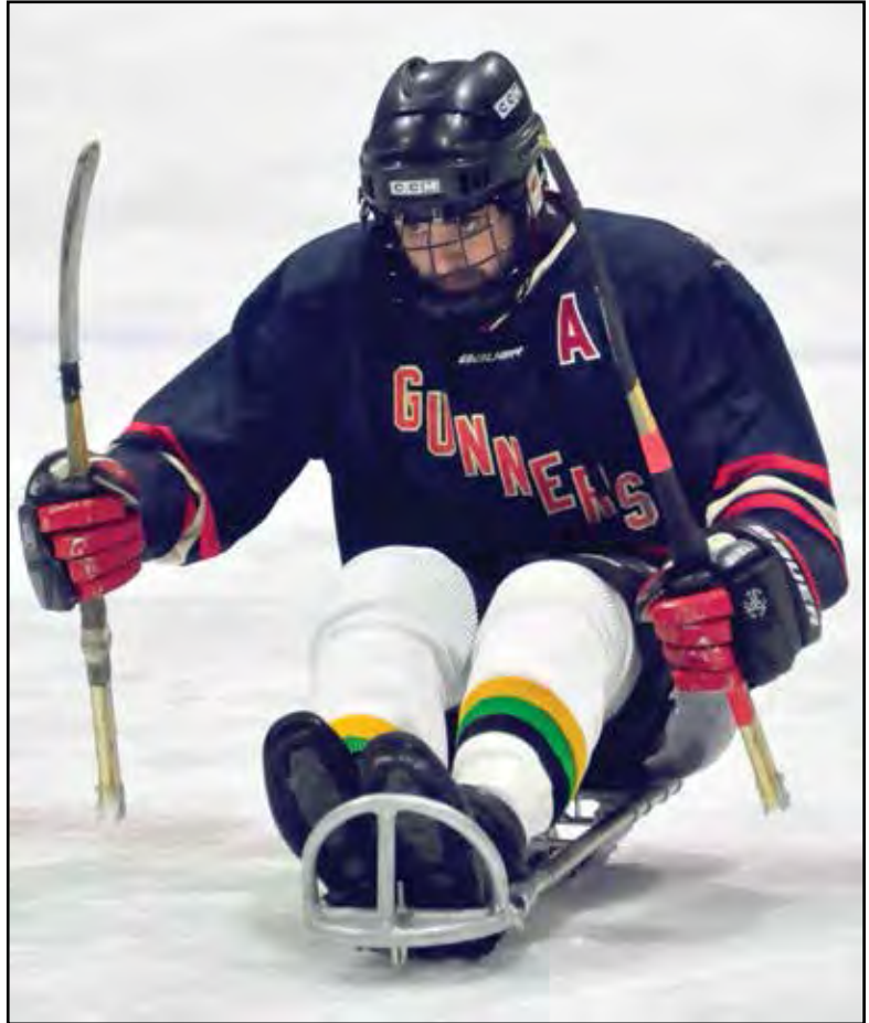
1 RCHA experienced a game of sledge hockey just before Christmas block leave at Gunner Arena.