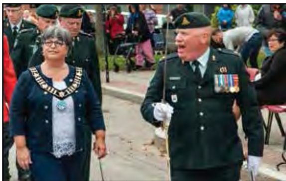
84 Independent Field Battery put on a Freedom of the City of Yarmouth for the first time since 1990.

L'automne a été très occupé pour la Batterie, lors de la cérémonie du droit de la cité pour la première fois depuis l'année 1990. Le défilé a été soutenu par la batterie et le régiment, ainsi que la fanfare du 36 GBC et les cadets locaux. La cérémonie a été suivie d'un dîner régimentaire. Le lendemain, la batterie a ouvert ses portes à la communauté pendant l'initiative de recrutement national. La formation d'artillerie de la batterie à continuer en participant à deux exercices de tir réels (Ex TRENCH GUNNER I et II), en plus d'un exercice joint avec l'école du Régiment Royal de l'Artillerie canadienne pour soutenir le cours IG. La batterie terminera une autre excellente année de formation avec l'annuel dîner d'appréciation des soldats et la balle du jour de Sainte Barbara le 8 décembre 2018.