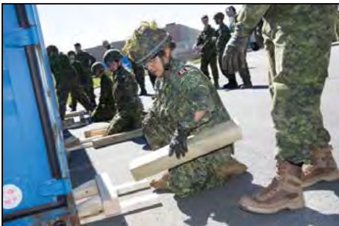
Basic LUSAR training in Halifax Sept. 21 to 23, 2018. Members of the LUSAR team practice cribbing.

The regiment closed out the year, as always, with a Soldier's Appreciation Dinner followed by Saint Barbara's Day Ball held December 8th when the soldiers and officers took a pause to celebrate the past year and reflect on all that was accomplished in 2018.