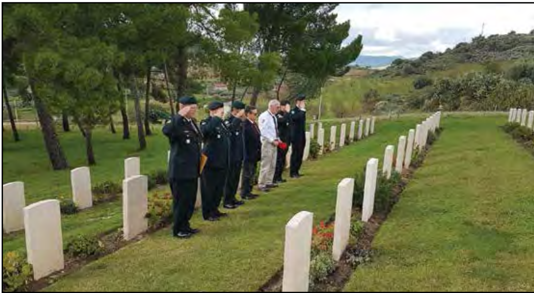
Cimetière de guerre canadien d'Agira / Agira Canadian War Cemetery, Agira, Sicily, Italy, OP HUSKY, 10 nov 18

Au début de la nouvelle année 2019, le régiment ira faire du tir direct à la BFC Gageton en janvier et poursuivra ensuite son entraînement LUSAR tout en donnant un cours d'adjoint de pièce. Il n'y a pas à dire, la nouvelle année commence dans l'action! UBIQUE!