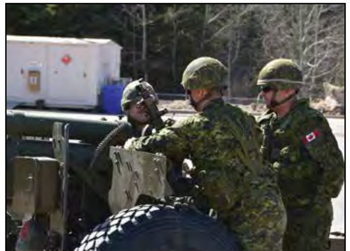
Dry deployments in Kenora.