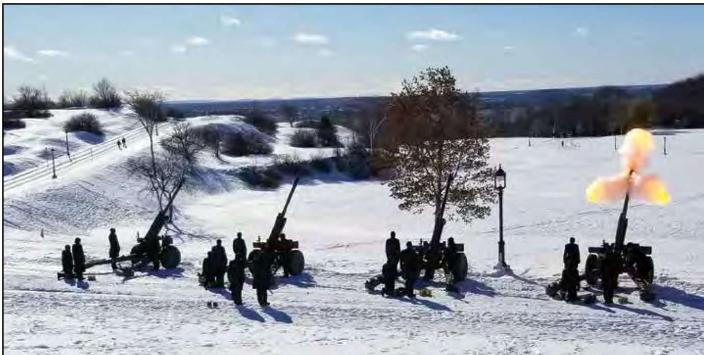
Le 6 RAC lors du tir de salut de l'Armistice le 11 novembre 2018.