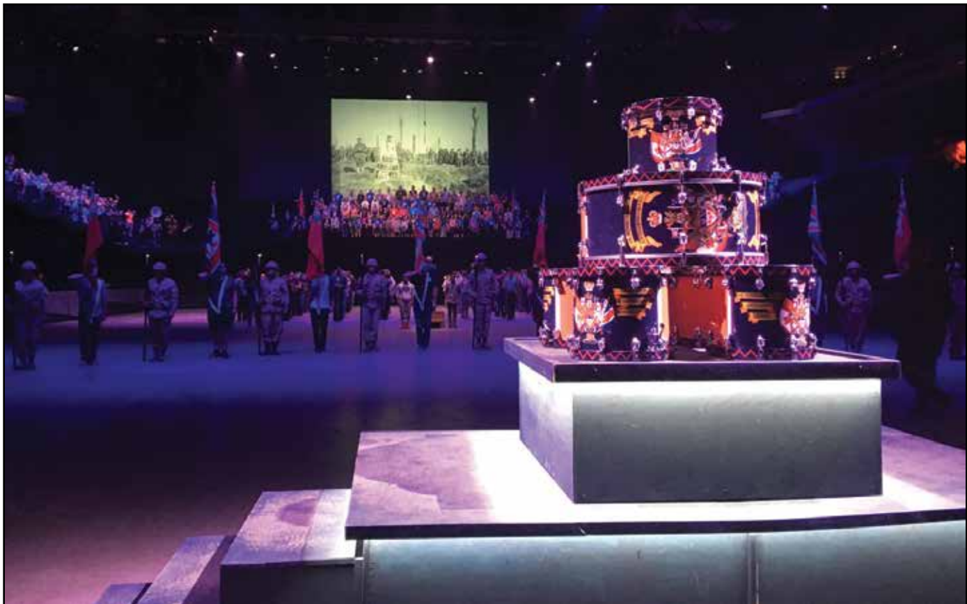
The drums of the Royal Canadian Artillery Band are stacked at the Royal Nova Scotia International Tattoo in a ceremonial drum piling as a tribute to the end of the First World War.