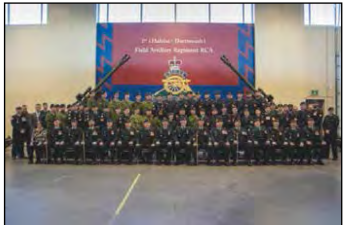
1 Fd Regt at Bayer's Lake Armouries on Dec. 8, 2018.