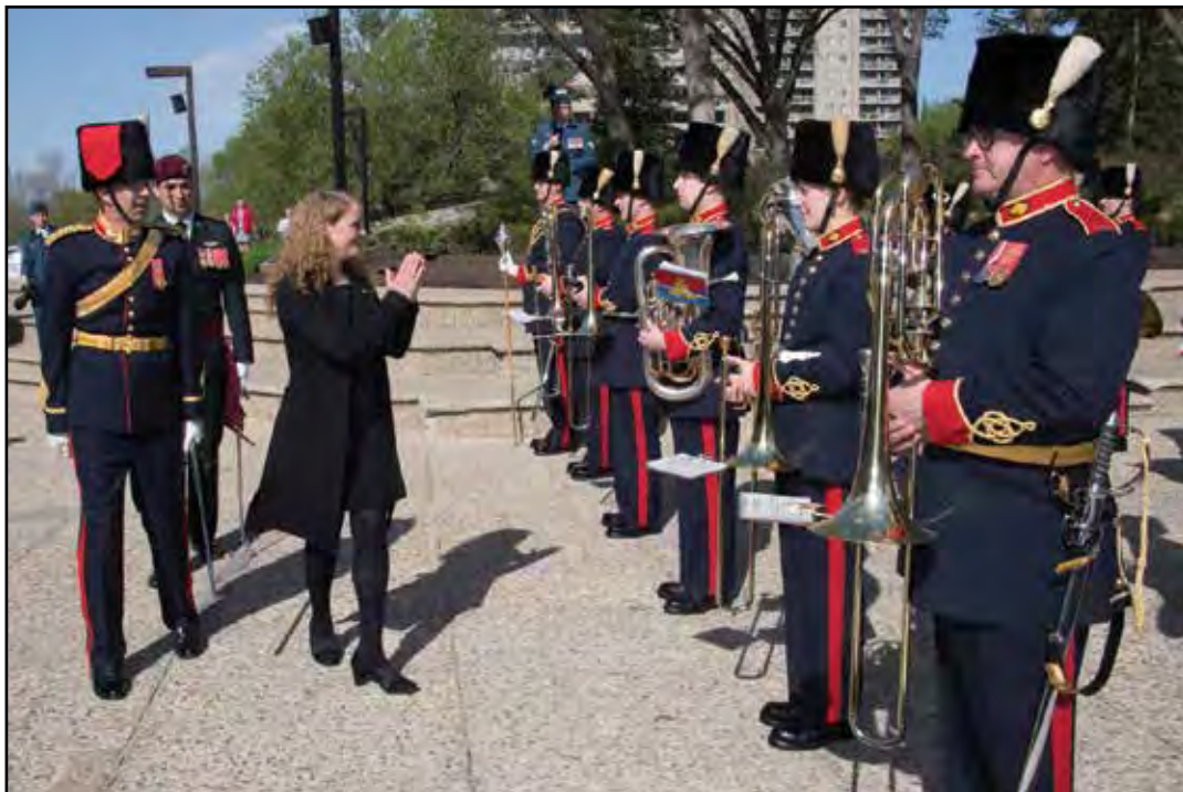
During a visit to Western Canada, Governor General of Canada Julie Payette inspects the RCA Band at the Alberta Legislature on May 15, 2018.

2018 was another very busy year for the RCA Band. The Band provided support to numerous military and civilian engagements with groups ranging from a single bugler to the full parade band with reserve augmentation. The Band undertook two major trips this year, first to Halifax for the Royal Nova Scotia International Tattoo in June and July, and to London UK to perform Public Duties in support of the Royal Canadian Regiment Guard in October and November.