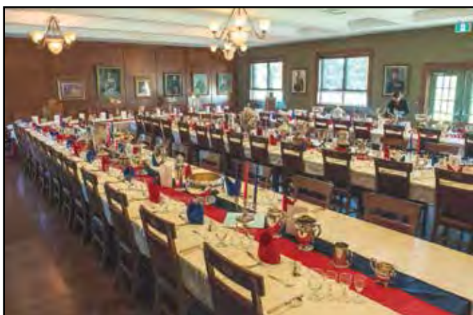
Preparing for 2018 JOC special guest night at CFB Shilo's officers' mess.

la compréhension et la fierté de l'histoire et des manières distinctives de notre régiment a encore été prouvée grâce à l'excellent travail du major régimentaire, du personnel du QGR ARC et de ceux qui ont voyagé de loin pour partager leur sagesse avec les participants du cours. L'inclusion des sergents fut un franc succès et est une pratique que nous entendons conserver.