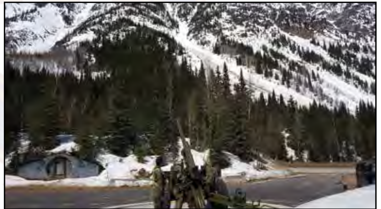
1 RCHA annually participates in Op PALACI in British Columbia in order to maintain avalanche control in the Rogers Pass. Soldiers from CFB Shilo use the C3 Howitzer to do their job, working alongside Parks Canada.