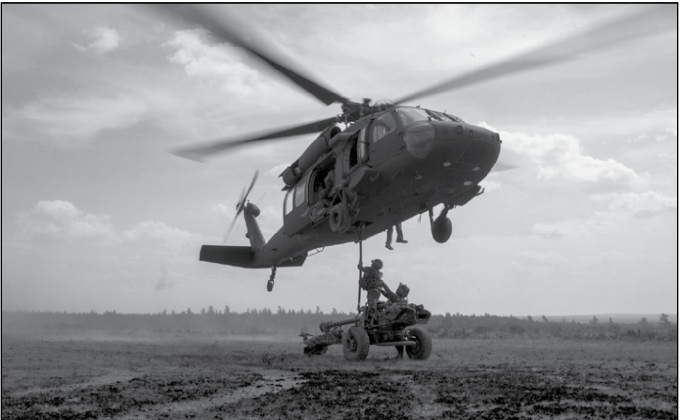
1 Fd Regt soldiers hook up their gun to a hovering helicopter.