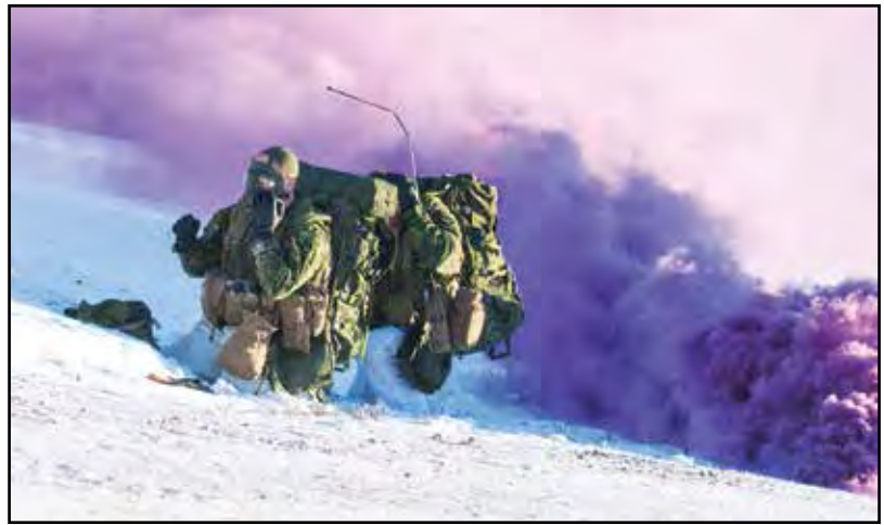
Colourful moment for soldiers during Ex SHOVEL GUNNER.

HQ & Svcs Bty maintained its high standard of support to the various 1 RCHA tasks. Starting in March, the Bty supported Ex FROZEN GUNNER while simultaneously taking great leaps in vehicle repairs. Shortly after, HQ & Svcs Bty provided CSS to the BC's Fire Planning Course, maintaining the high exercise tempo amidst numerous vehicle breakdowns and equipment failures. Later in the year, the Bty enabled the conduct of numerous PCF courses which ensured the readiness of 1