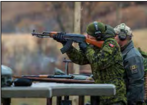
1 RCHA travelled to Virden, MB, where they were exposed to a number of new weapons provided by Wolverine Supplies.