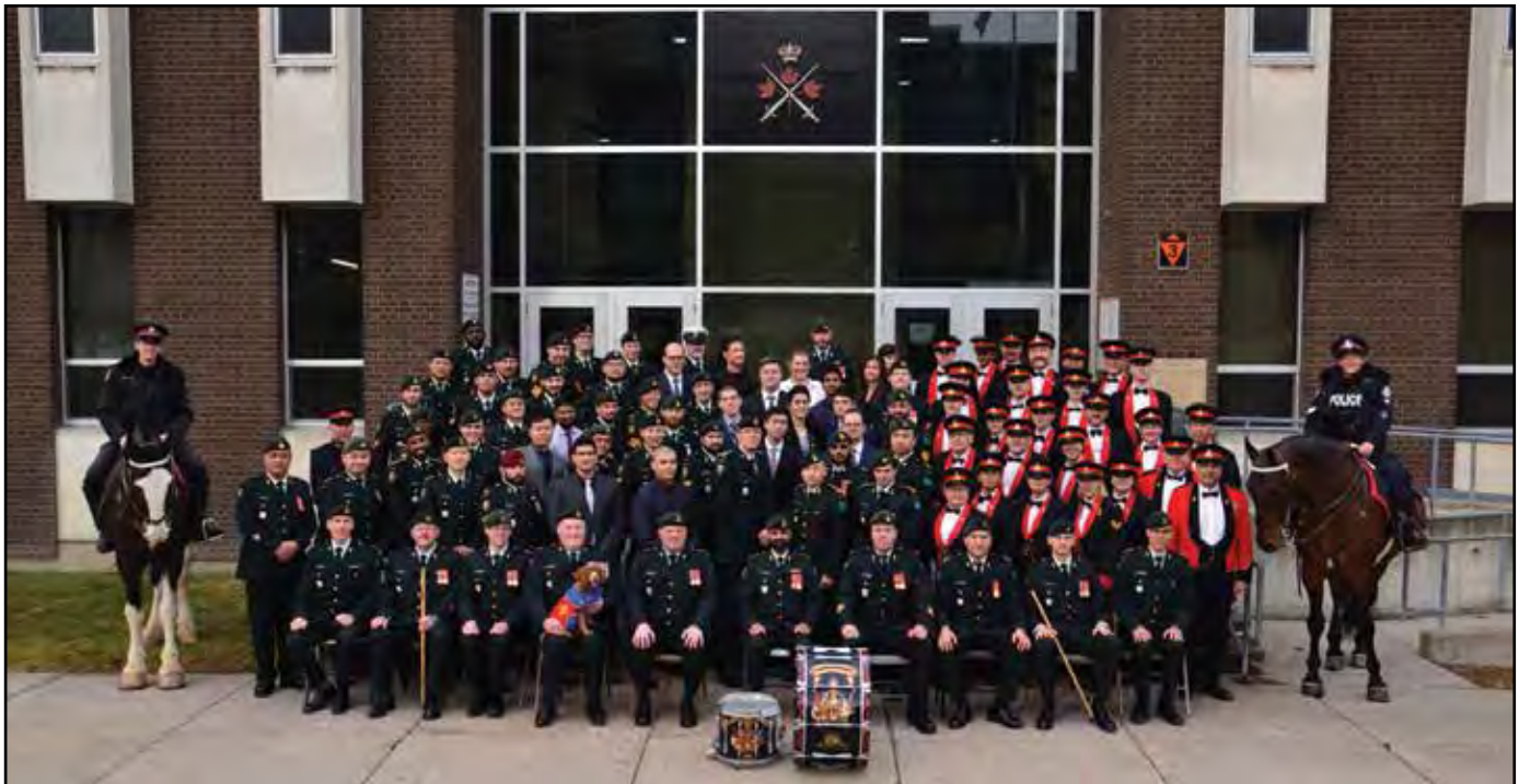
7th Toronto Regiment Iron Warrior Team, Band, Hon Col and former RSM after the horse rededication ceremony held Sept. 5, 2018.