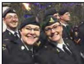
Lookin' good at Ex MERRY BARBARA 2018.