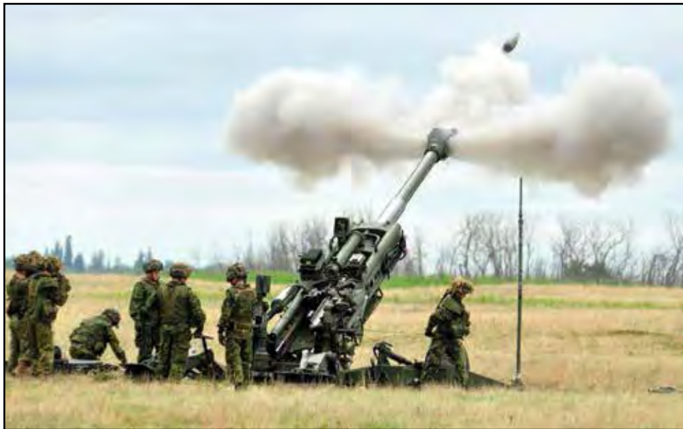
M777 fired during B Bty CoC ceremony held out in training area.

Bty, along with an FSCC, were deployed under austere conditions while 3 PPCLI conducted dispersed operations in the close wooded terrain of Joint Base Lewis-McChord.