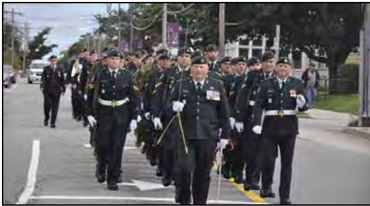
The 84th Independent Field Battery had another eventful year in, continuing to produce quality soldiers for the garrison of Artillery in Nova Scotia.