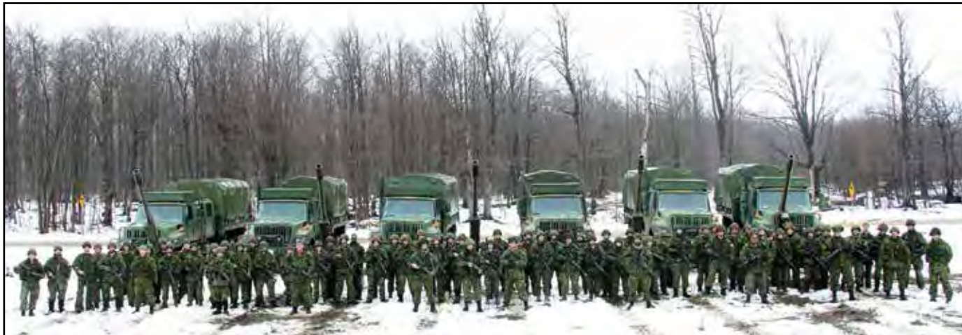
Ex AUTUMN GUNNER Nov 18 4CDTC MEAFORD. 56 Fd deploys 5 guns for November FTX" 56 Field.

In December, members of the Regiment gathered for a celebration in honour of St Barbara and a Christmas dinner to close out a successful training year.