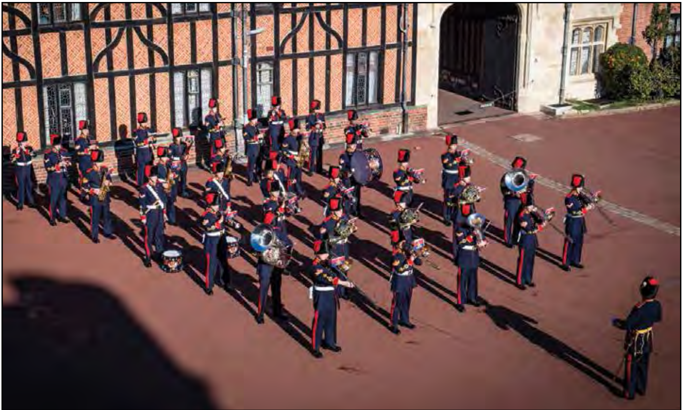
The Royal Canadian Artillery Band plays an arrangement during the Mounting of the Queen's Guard at Windsor Castle in the Royal Borough of Windsor on October 27, 2018.