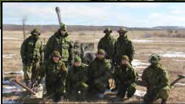
Above: A Gun Detachment in action. 56 Fd Regt RCA soldiers put rounds on target on Ex HOGTOWN GUNNER in Meaford.