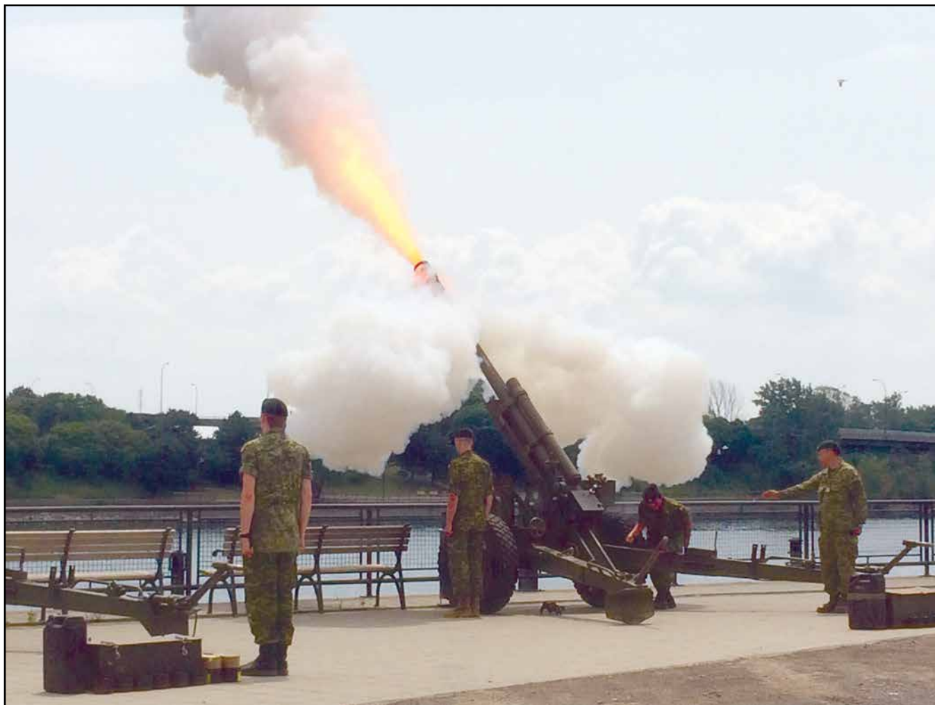
Tir de salut Fête du Canada / Gun Salute Canada Day, Downtown Montréal Centre-ville, 1 juil 18