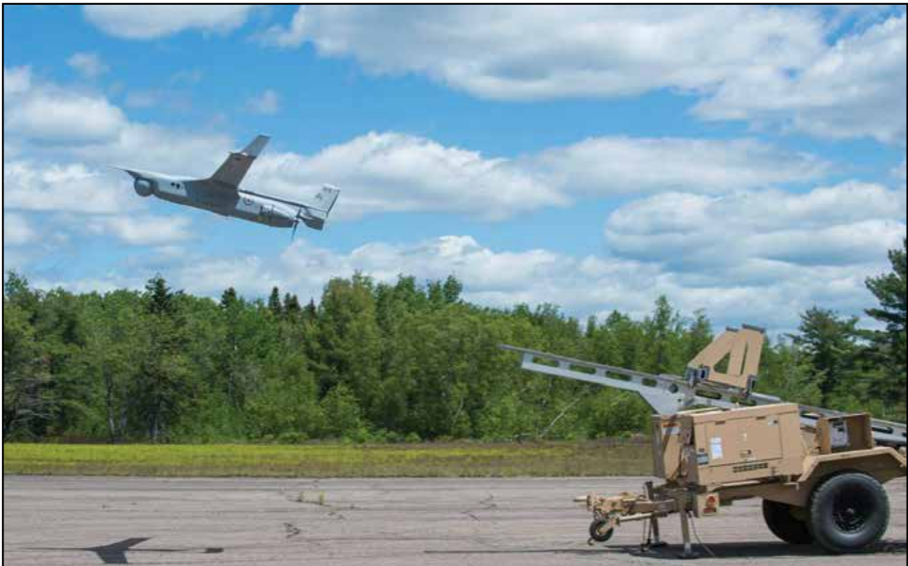
After being prepared by the maintenance crew, the new Blackjack SUAS is launched in the air for the very first flight of the Acceptance Test.

With the year coming to a close, members of the Regiment took some time to engage in much needed merriment during the annual St. Barbara's Day festivities. This year's sporting events were enhanced by the Sappers of 4 Engineer Support Regiment and the Canadian Forces School of Military Engineering joining the Gunners of 4 Regt (GS) and the RCAS in friendly competition, which was ultimately dominated by 4 Regt (GS). With the delivery of key equipment in 2018, 4 Regt (GS) can reassert its role as a force multiplier for the Canadian Army, and be a driving force for change in the Royal Regiment. We look forward to strengthening the Gunner family throughout 2019, and working with you all on exercises and deployments to come. UBIQUE!