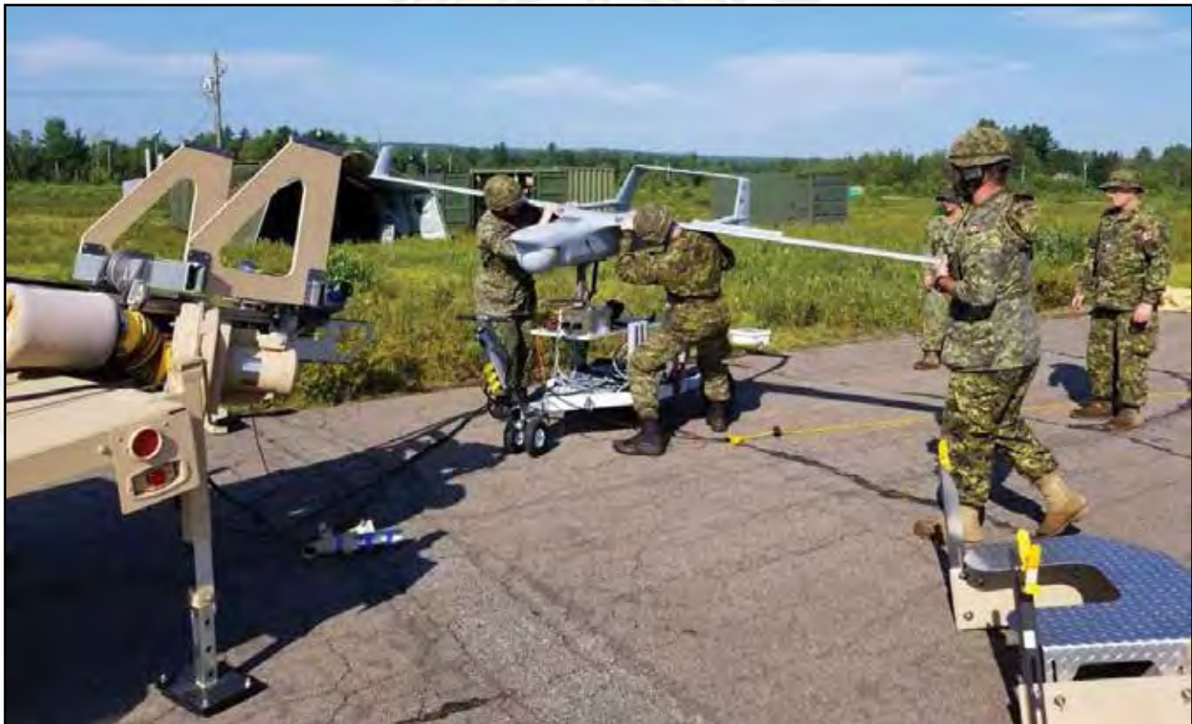
The new Blackjack SUAS is being prepared by the maintenance crew in preparation for flight.