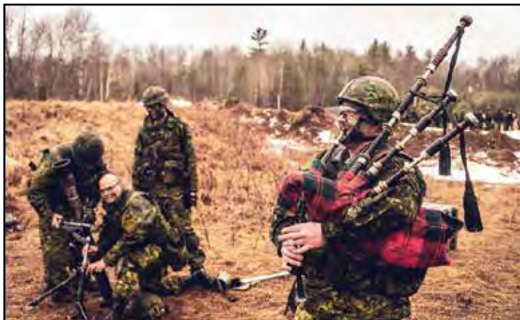
A member of the Royal Highland Fusiliers of Canada plays the bagpipes during Ex HIGHLAND DRAGON, a live-fire confirmation shoot for infantry mortarman course run by D Bty.

In February 2018, over 100 members of 2 RCHA – largely comprised of D and E Battery members – deployed on the first of three TAVs to Latvia. The first TAV was on ROTO 9, Op REASSURANCE from 11 Feb 18 – 18 Mar 18 in Latvia. While on Op REASSURANCE, members of 2 RCHA conducted joint training, exercises, and some NATO-specific tasks demonstrating assurance and deterrence measures were in place. Approximately 20 Y Bty members deployed to Latvia along with members of D and E Bty in support of Op REASSURANCE Rotations 9 and 10. They were employed as forward observers within the Enhanced Forward Presence Battle Group (eFP BG) led by the 2nd and 1st Battalions, the Royal Canadian Regiment respectively. Later in the month, members belonging to DART took part in Ex READY RENAISSANCE as part of the team's ongoing readiness training in order to ensure their