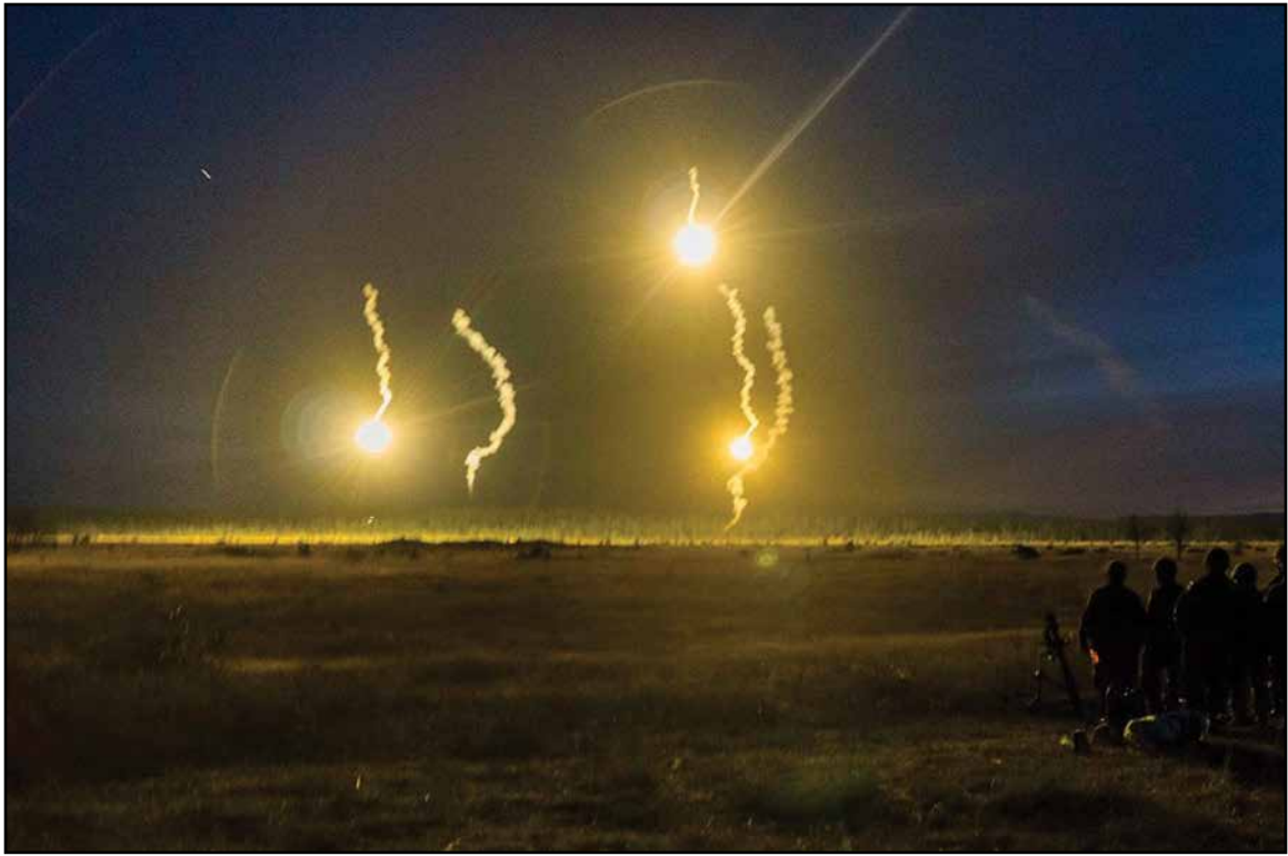
Night view of Ex CAUSTIC SHOCK.