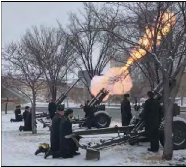
The Royal Regiment Salute marking the centenary of the end of the First World War was held around the world, from Canada to New Zealand, in Britain and Australia. Artillery was fired at 11 a.m. on Nov. 11, 2018.