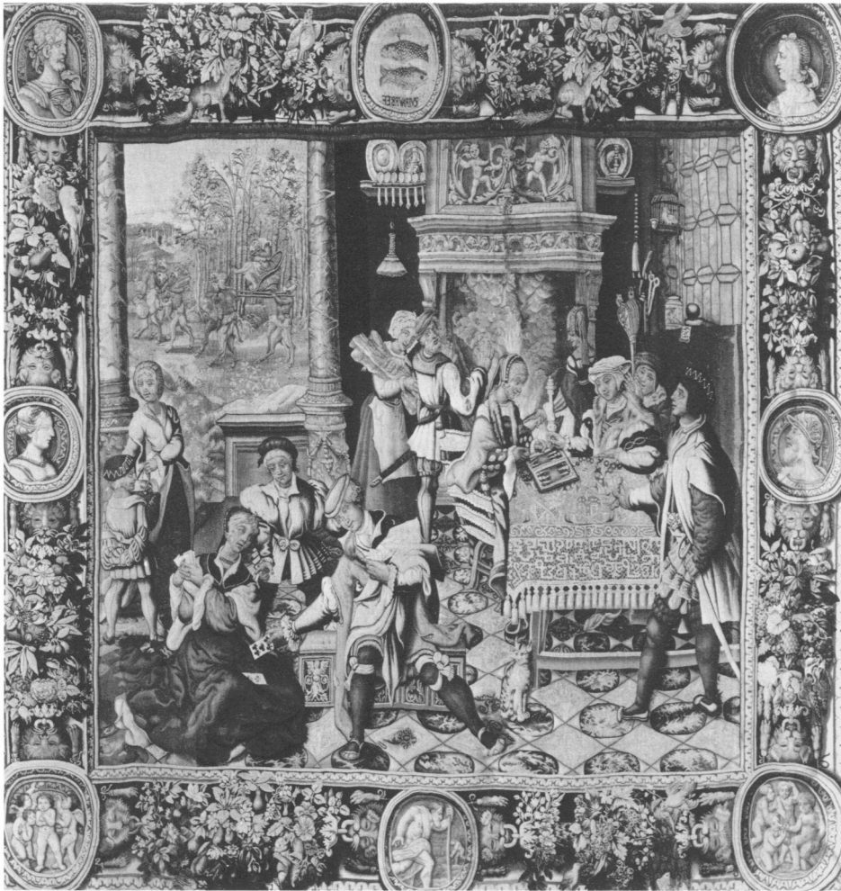
Figure 2. Jean Lefebvre workshop (probably) after a 16th-century Flemish artist. February , late 17th century. Wool and silk tapestry (Gobelins), 28.6 m square. The Detroit Institute of Arts, Gift of K. T. Keller