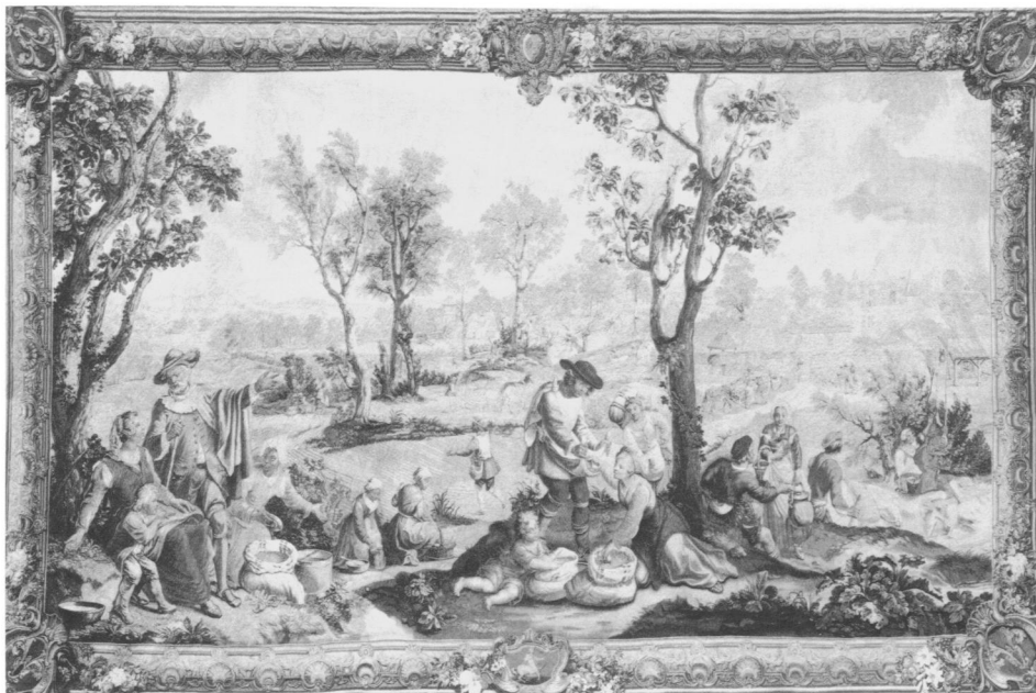
Figure 14. Michel Audran workshop after a 16th-century Flemish artist with 18th-century French additions. November , 1732–37. Wool and silk tapestry (Gobelins), 3.61 × 5.79 m. Gift of John D. Rockefeller Jr., 1944, 44.60.9