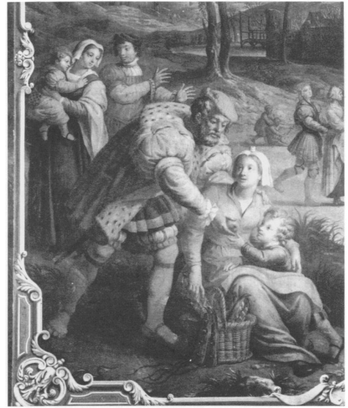
Figure 18. French 18th-century artist. December (detail). Oil on canvas. Musée National du Château du Fontainebleau