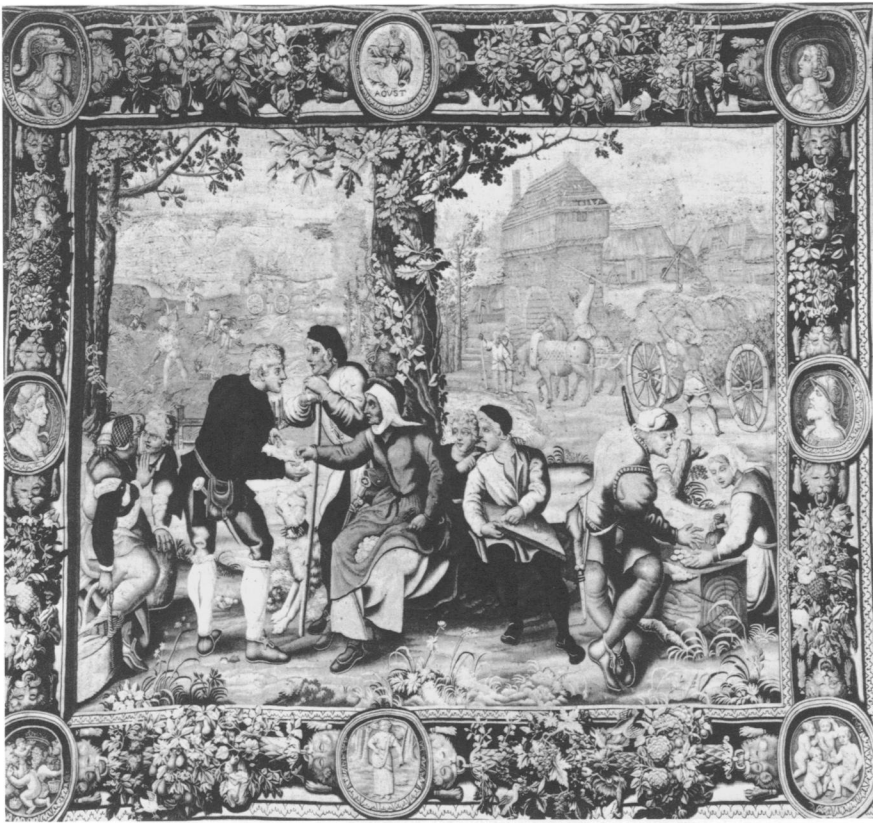
Figure 10. Jean Souet workshop after a 16th-century Flemish artist. August , 1714–15. Wool and silk tapestry (Gobelins), 308 × 340 cm. Oslo, Kunstindustrimuseet