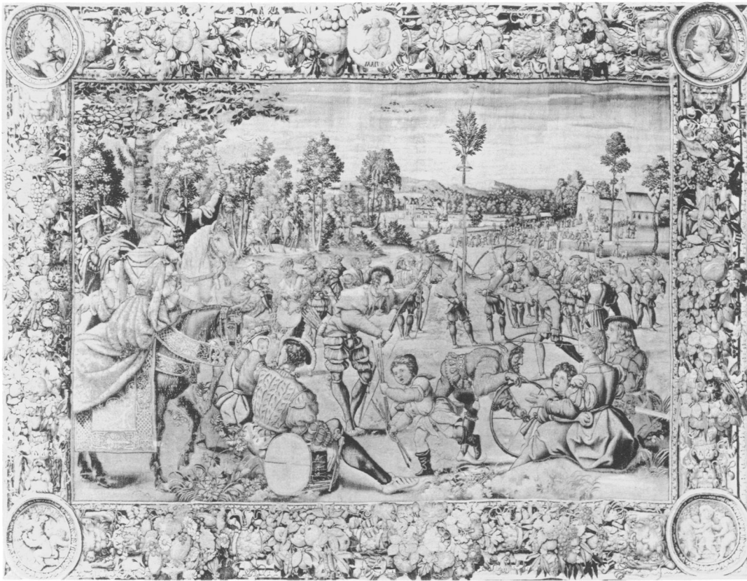
Figure 6. Brussels workshop after an unknown Flemish artist. May, 16th century. Wool and silk tapestry, 3.15 × 4.11 m. San Marino, Henry E. Huntington Library and Art Gallery