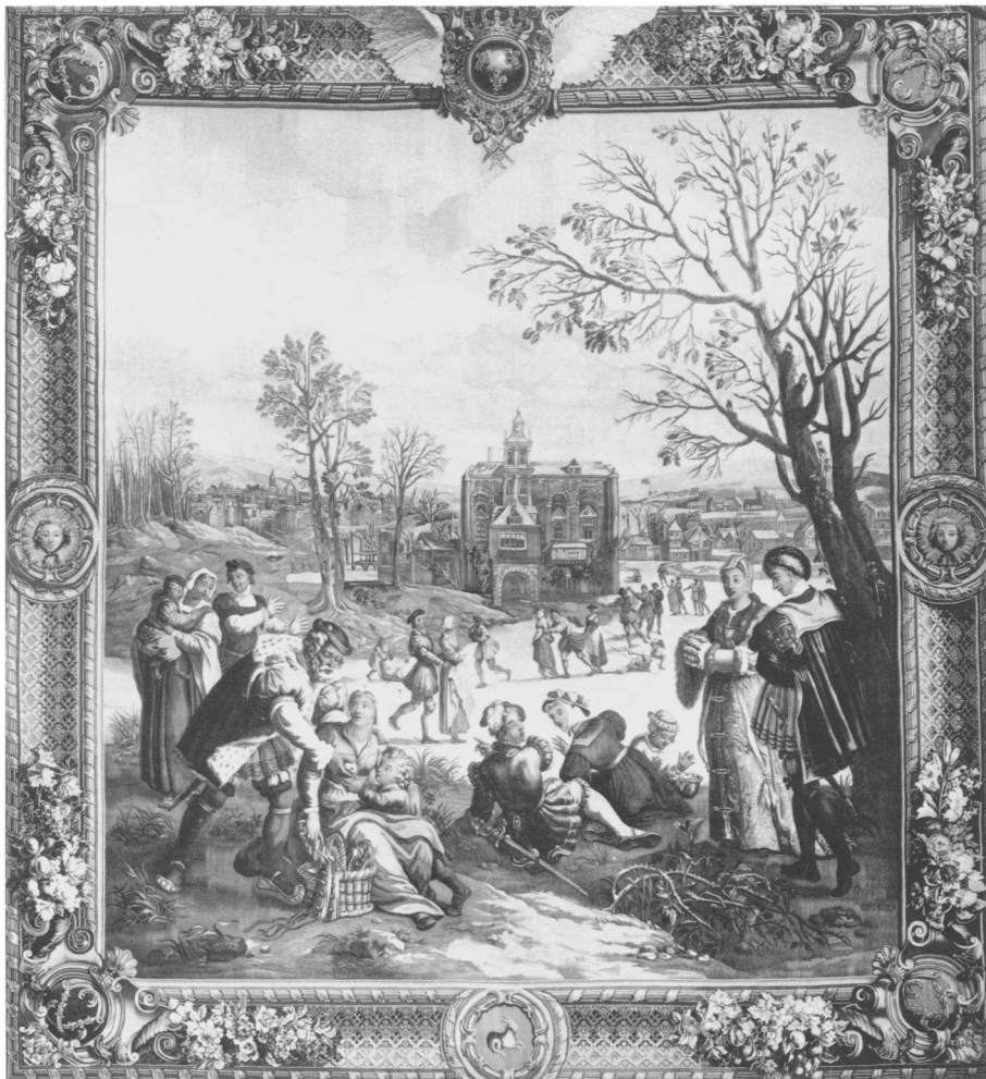
Figure 19. Mathieu Monmerqué and Pierre-François Cozette workshop after a 16th-century Flemish artist. December , 1748–50. Wool and silk tapestry (Gobelins), 4 × 3.60 m. Rome, Palazzo Doria