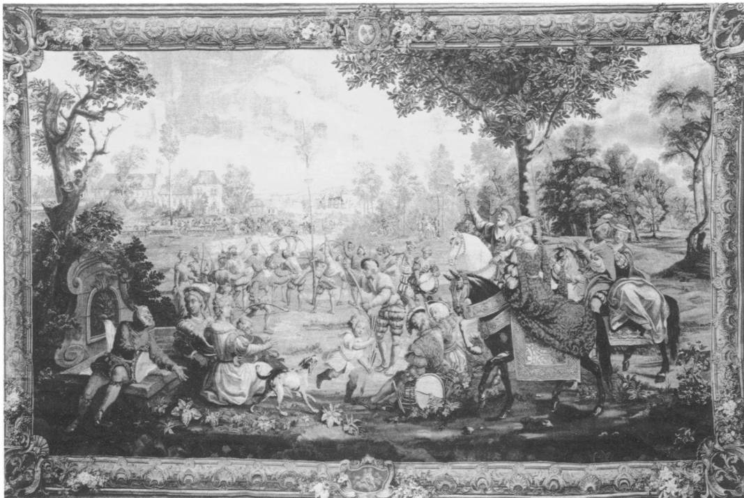
Figure 7. Michel Audran workshop after a 16th-century Flemish artist with 18th-century additions. May , 1732–37. Wool and silk tapestry (Gobelins), 3.61 × 5.87 m. Gift of John D. Rockefeller Jr., 1944, 44.60.4