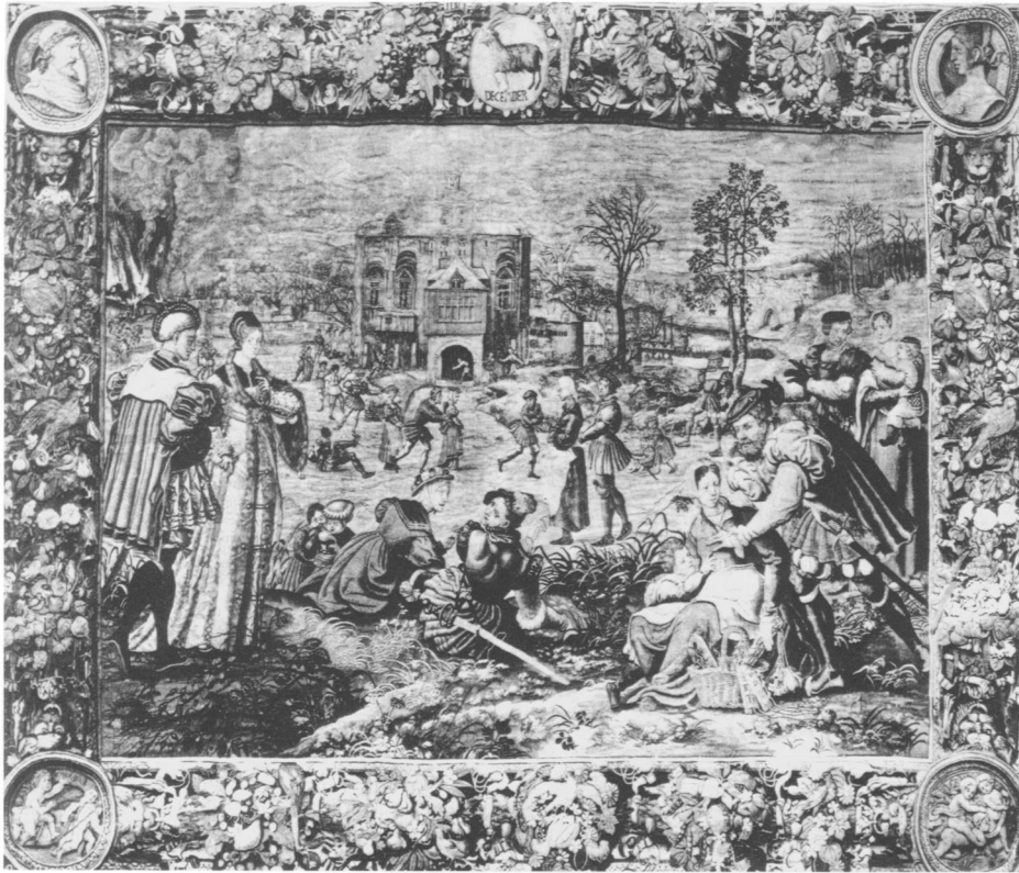
Figure 15. Brussels workshop after an unknown Flemish artist. December , 16th century. Wool and silk tapestry, 3.68 × 3.06 m. The Denver Art Museum