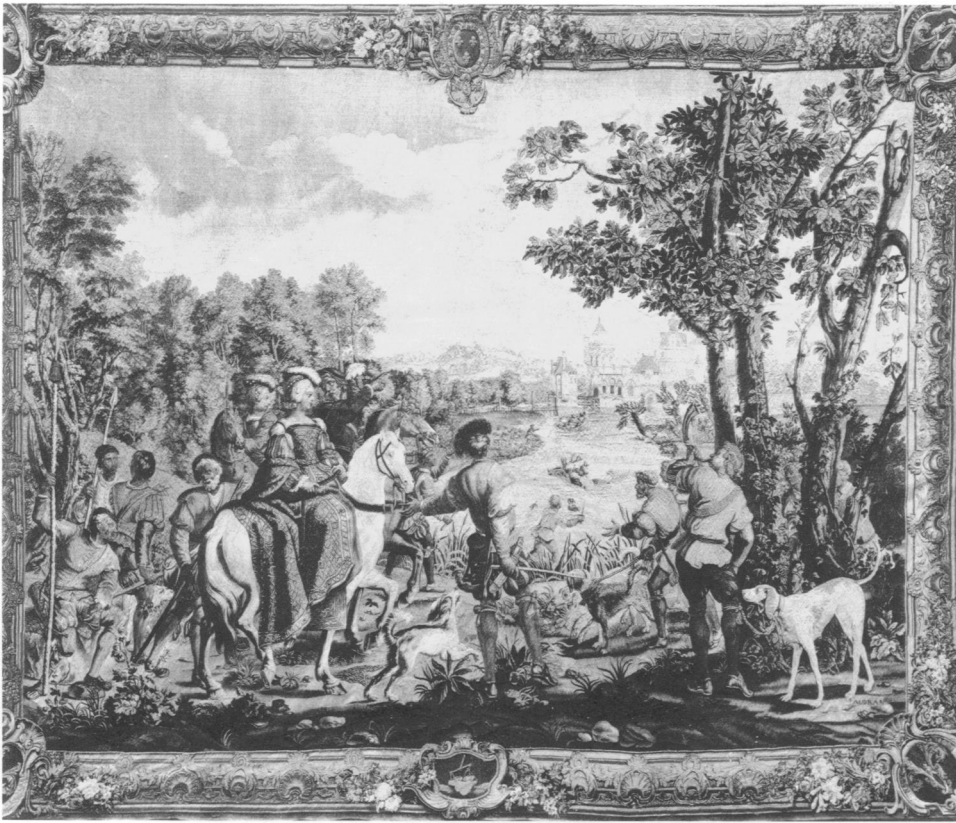
Figure 12. Michel Audran workshop after a 16th-century Flemish artist with 18th-century additions. September , 1732–37. Wool and silk tapestry (Gobelins), 3.61 × 4.72 m. Gift of John D. Rockefeller Jr., 1944. 44.60.7

the left, he copied the shelf with silverware and dangling spoons from the same objects seen beside the fireplace in the center of the original tapestry. Below, another shelf and a parrot on its stand do not seem incongruous, but on the right he added a doorway with huge vases, probably Chinese, above it: this undoubtedly looked sufficiently old-fashioned to the artist, as it reflects the style of the last quarter of the seventeenth century, although it is inappropriate for the sixteenth. 30 The large books on the high shelf to the left of the doorway also seem out of place.