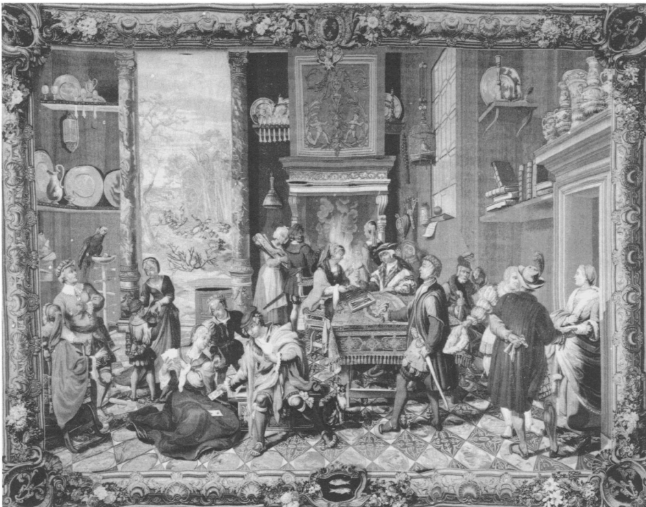
Figure 3. Michel Audran workshop after a 16th-century Flemish artist with 18th-century additions. February , 1732–37. Wool and silk tapestry (Gobelins), 3.55 × 4.65 m. Paris, Collection du Mobilier National