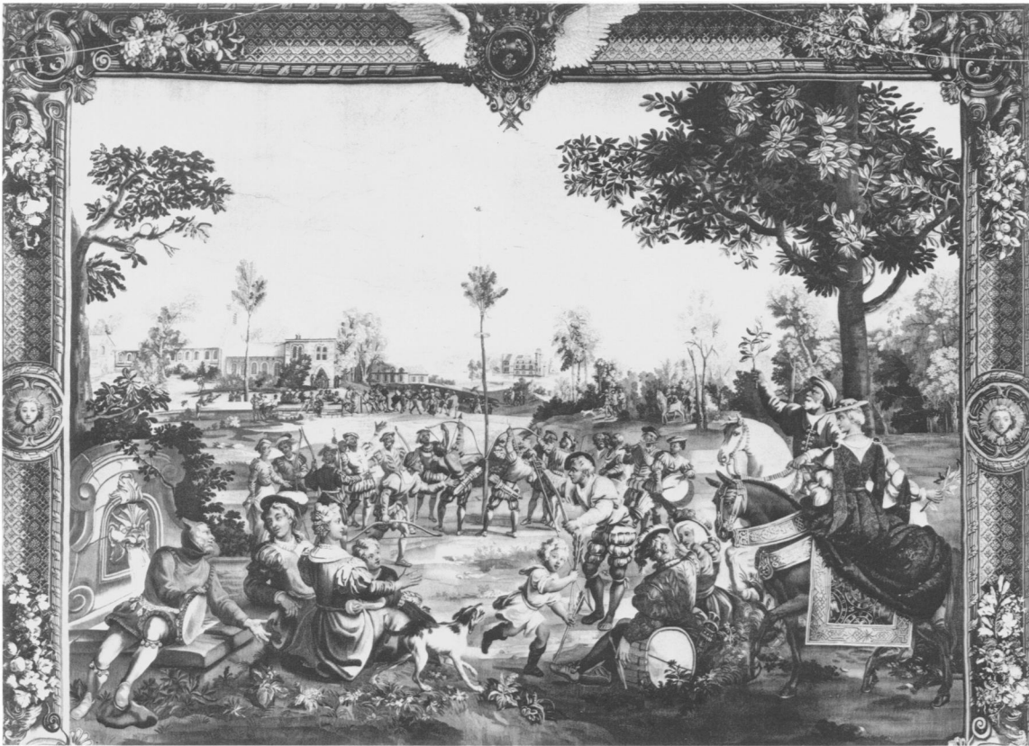
Figure 8. Mathieu Monmerqué and Pierre-François Cozette workshop after a 16th-century Flemish artist with 18th-century additions. May , 1747–51. Wool and silk tapestry (Gobelins), 4 × 6.71 m. Rome, Palazzo Doria