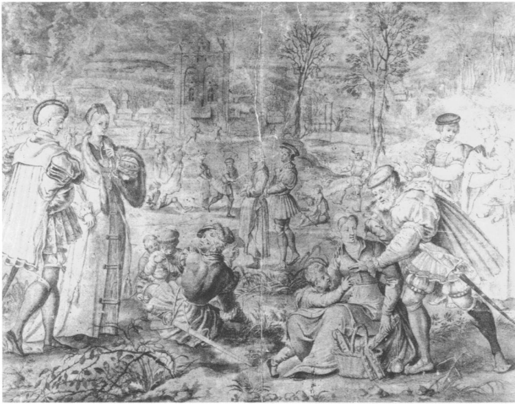
Figure 17. Flemish 16th-century artist. December . Point of the brush and brown wash over black chalk, heightened with gold, on brown ground, 32.2 × 47.2 cm. Chatsworth, Devonshire Collection