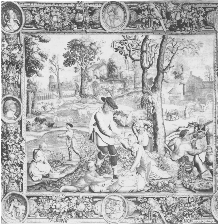
Figure 13. Jean de la Croix workshop after a 16th-century Flemish artist. November , 1688–89. Wool and silk tapestry (Gobelins), 3.4 m square. Musée national du château de Pau