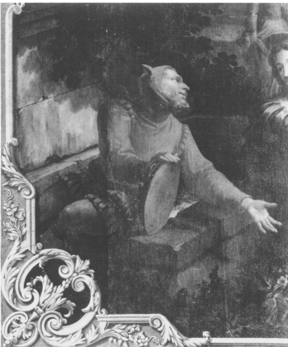
Figure 9. French 18th-century artist. May (detail). Oil on canvas. Musée National du Château de Fontainebleau