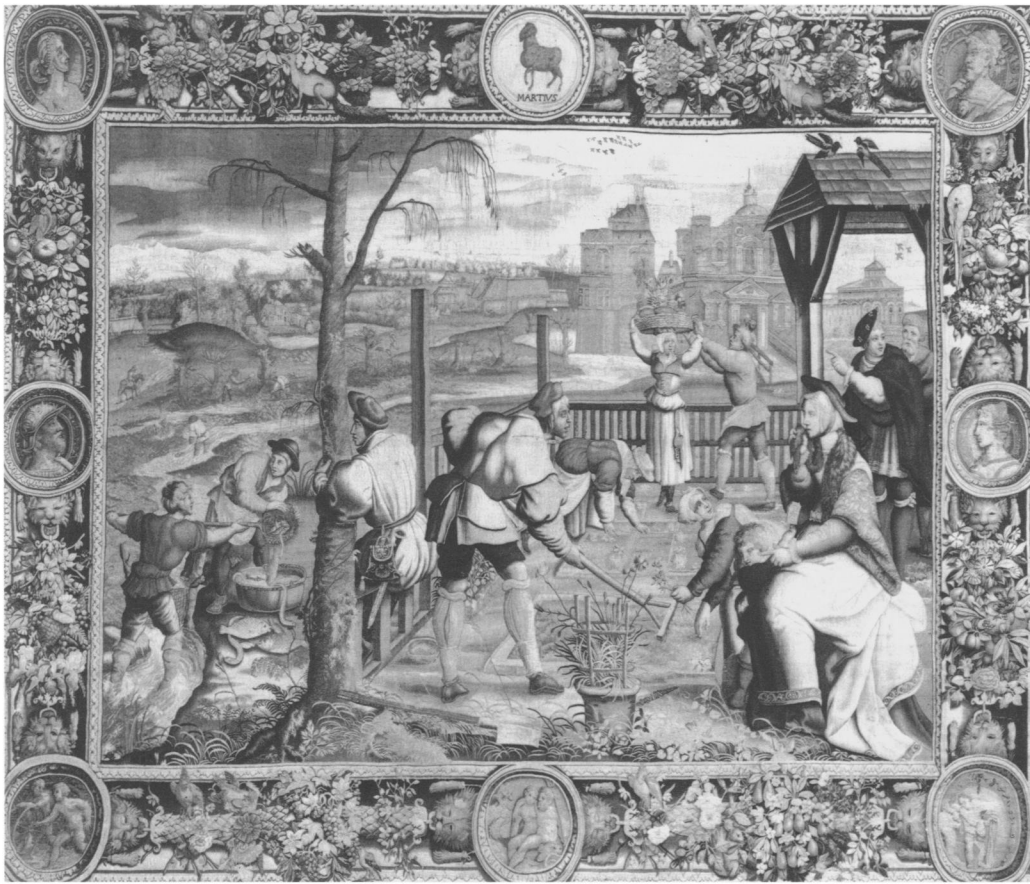
Figure 4. Jean de la Croix workshop after a 16th-century Flemish artist. March , 1688–89. Wool and silk tapestry (Gobelins), 3 × 3.61 m. Musée national du château de Pau