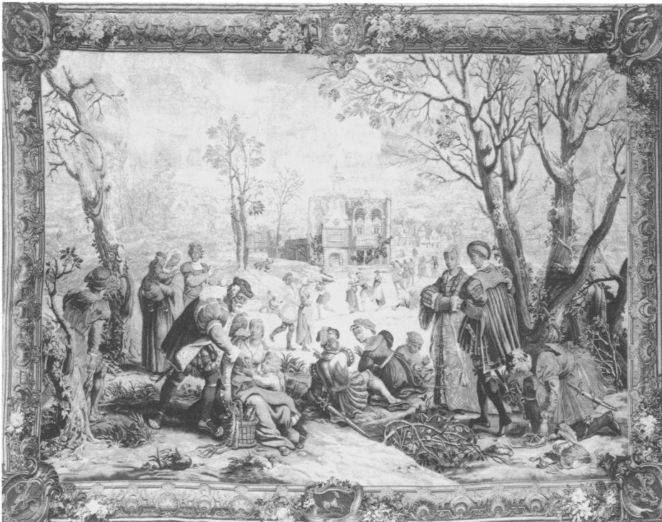
Figure 16. Michel Audran workshop after a 16th-century Flemish artist with 18th-century additions. December , 1733–37. Wool and silk tapestry (Gobelins), 3.55 × 4.8 m. The Metropolitan Museum of Art, Gift of John D. Rockefeller Jr., 1944, 44.60.10