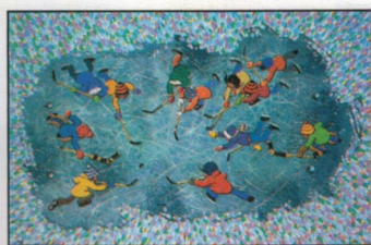
"In the Dead of Winter"