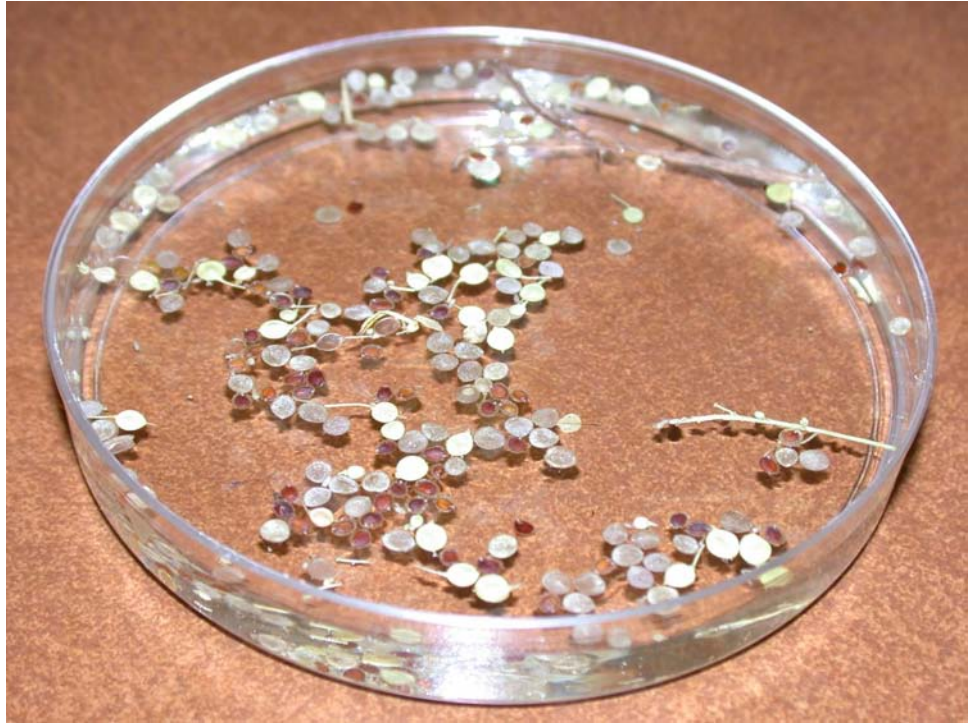
Figure 6. Seeds and fruits floating in water in a Petri dish in the lab. Seeds continued to float for more than 24 hours until the dish was discarded. Many seeds had begun to germinate vigorously (while floating) by that time.

Seeds that have been released from their papery covering, and those with the covering intact, float on water (Figure 6), indicating that wind/and or water may be responsible for the non-human mediated dispersal observed in the Illinois Valley.