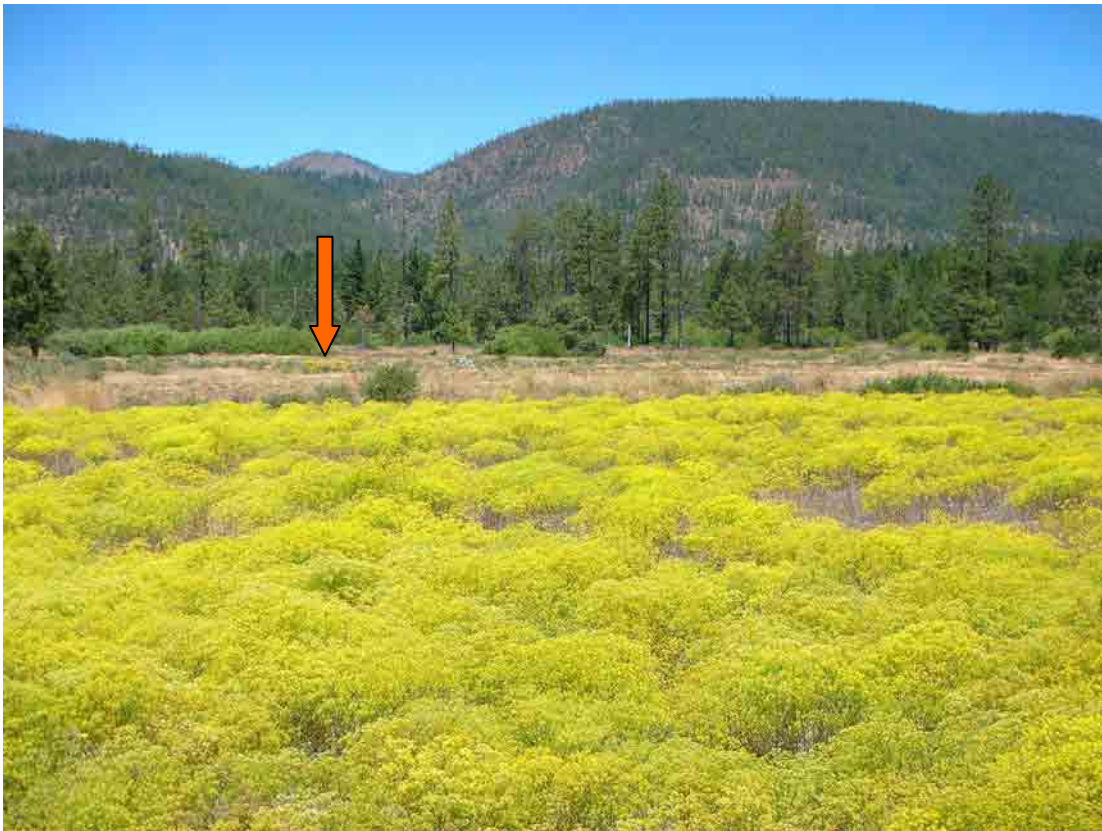
Figure 10. A crop of Alyssum corsicum on private property abuts the south side of Airport Drive. Orange arrow indicates a satellite population of Alyssum which appears to be growing along the ditchline. The ditch originates at Seats Dam on National Forest land where the first A. murale infestation was detected in 2006. To date surveys show the ditchline is clean from Seats Dam to the Airport property. Alyssum may be spreading in the ditch from the airport property onto private land.

The locations of nine cultivated plantings, including those at the Illinois Valley Airport, are currently known. The documented escape and proliferation of plants from the airport fields suggests that plants from the additional eight fields also have the potential to escape, and observations by citizens and USFS staff in 2006-2008 confirm the presence of plants outside cultivated field boundaries (Figure 10). The planting which poses the greatest risk of spread onto public land is located at Sauer's Flat immediately adjacent to the Illinois River. Plants in this site have been allowed to set seed for crop development research, and the potential for seed from this site to enter the Illinois River, be deposited along the Wild and Scenic Corridor, and eventually pass into the Kalmiopsis Wilderness makes this site especially problematic. Plantings at Lone Mountain Road and Westside Road also pose concern due to their proximity to vast tracks of USFS managed land containing serpentine soils (Josephine ophiolites). Seed from fields at Happy Camp Road could spread via Elder Creek which drains into the East Fork of the Illinois River.