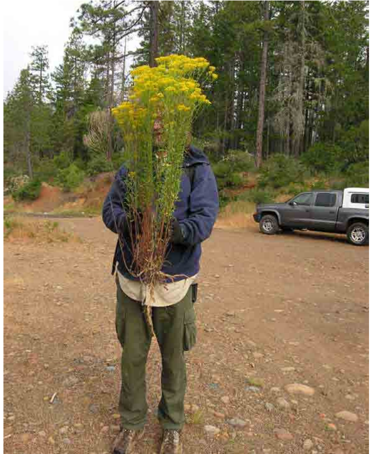
Figure 3. Plant of A. murale pulled from the Seats Dam site in 2007.

The showy flower clusters of both Alyssum species attract numerous insects. Although both species are reported to exhibit “low seed set” and be self-incompatible (McKenna et al. 2002), seed set on escaped plants in the Illinois Valley - even those occurring as single isolated individuals - is high. Both species produce the papery, circular to oval flattened fruits (silicles), each with a single flattened seed, that are typical of the genus. Hundreds of seeds are produced by each plant, and germination in the field is prolific. Seeds shed from baled plants as they were transported from satellite locations within the Illinois Valley to the Airport for processing are also viable, and their ability to germinate and grow under harsh conditions has allowed for the development of several roadside populations (Figure 4).