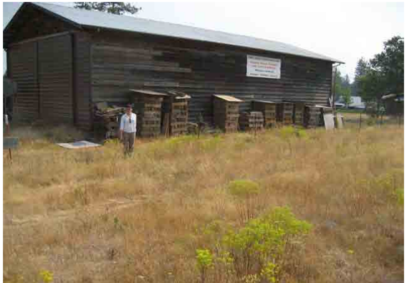
Figure 12. Flowering plants of Alyssum adjacent to the Good Earth Organics soil company.

In 2007, the Good Earth Organics soil company began a compost operation adjacent to the Illinois Valley Airport. Compost is stored at this location, and this retail operation sells soil for use throughout the valley. Alyssum grows in the fenceline next to property used by Good Earth Organics (Figure 12), and cut inflorescences with mature seed have a high chance of blowing from the fields onto the soil company site. Seed dispersal into this area potentially allows for the spread of contaminated soils into other suitable serpentine habitat throughout the county.