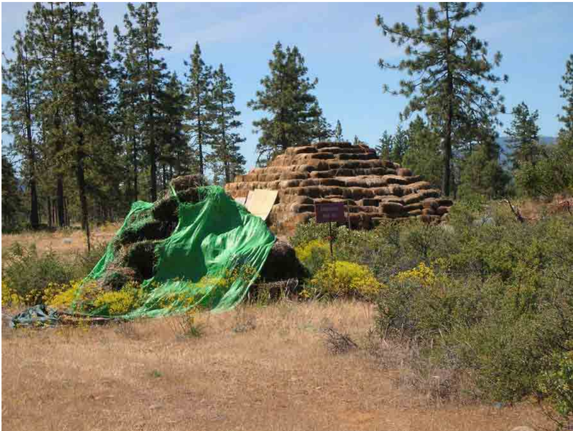
Figure 12. These bales of Alyssum , harvested over a period of several years, and awaiting processing at the airport site, harbor viable seed. Roadside infestations of this species were probably caused by seed spread during transport of bales to this site, or by seed carried on the wheels of equipment moving among cultivated fields.

Bales placed at the airport from 2004 through 2007 have not been removed, and processing of material from any site had not occurred as of 2007 (Mark Weist, Viridian Resources, personal communication, 2007). Seed released from bales is viable, and numerous seedlings appear throughout the storage areas (Figure 12). Despite mowing of some portions of the airport site in 2008, large amounts of seed continue to be produced and dispersed from plants within field boundaries, as well as outliers throughout the area.