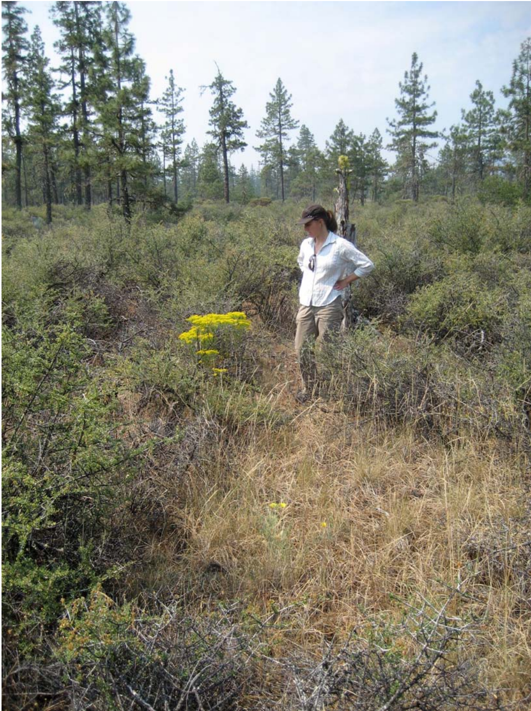
Figure 9. A. murale growing within an undisturbed plant community hundreds of feet from a trail or road within the Rough and Ready Area of Critical Environmental Concern. A total of five plants were discovered and removed from this site in 2008.