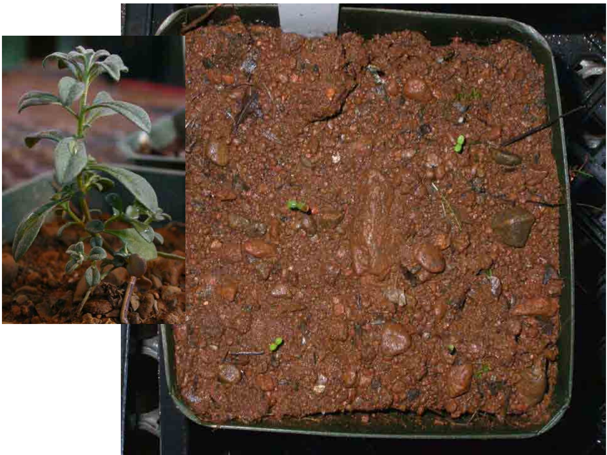
Figure 5. All four seeds planted in this pot of soil collected from the Illinois Valley emerged vigorously within a few days of planting. The overall emergence for this treatment was 60%; n = 9. Inset shows plant after three weeks.

Although the dispersal mechanisms characteristic of A. murale in its native habitat are not known, fruits of this species are papery and fairly light, and can be easily blown by wind. In addition, portions of corymb with attached fruits easily break away from the mature plant, and these dry “mini-tumbleweeds” are also readily dispersed by wind.