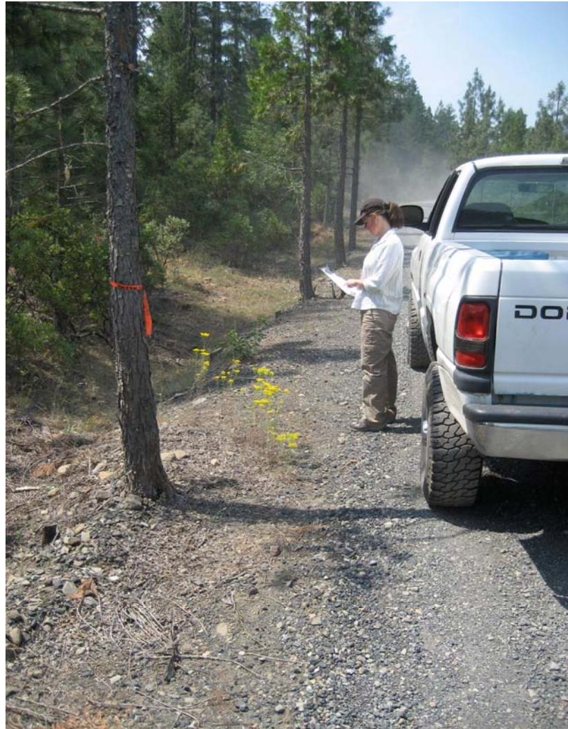
Figure 4. An A. murale population found at the base of the Lone Mt./Wimer road in 2008. This population consisted of 198 seedlings and 21 flowering plants - all were removed after documentation. The road is a primary access route onto the Josephine ophiolite shield (one of the largest and most botanically unique masses of serpentine bedrock in North America).

on serpentine soil were much more vigorous, with some starting to produce flowers. Germination also occurred in unheated flats in the nursery yard, although at lower rates. This study corroborates the results of earlier research demonstrating high survival rates (92% survival) for A. murale seedlings planted on nickel rich soils under field conditions