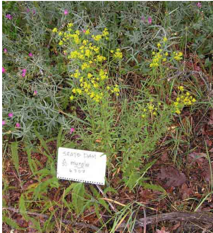
Figure 1. A specimen of A. murale in flower at the Seats Dam site in 2007.

In the late 1990's, the proposed uses of Alyssum murale were expanded to include not only phytoremediation (decontamination of mine wastes), but phytomining, the removal of metals from naturally occurring mineral soils. Oregon State University Extension Service evaluated use of this plant as a new farm crop in 2002, and indicated that neither A. murale nor the related