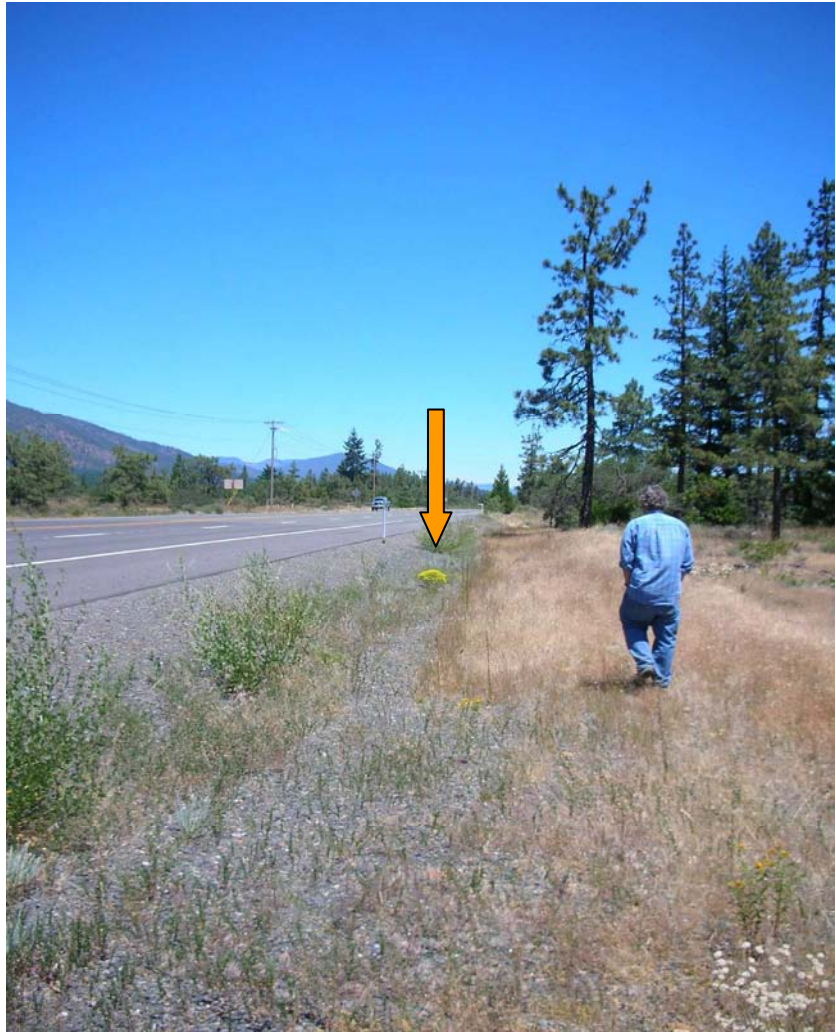
Figure 7. Bob Meinke (ODA) approaches one of five flowering A. murale plants growing along Highway 199 directly across from the state Rough and Ready Botanical Wayside in 2008. One plant was removed by ODA staff from this same location in 2007.

of serpentine plant communities generally protect them from invasion by weeds, vigorous, well-adapted perennials such as A. murale and A. corsicum have the potential to establish themselves on southern Oregon’s nickel-rich soils as easily as on the serpentine of their native habitats.