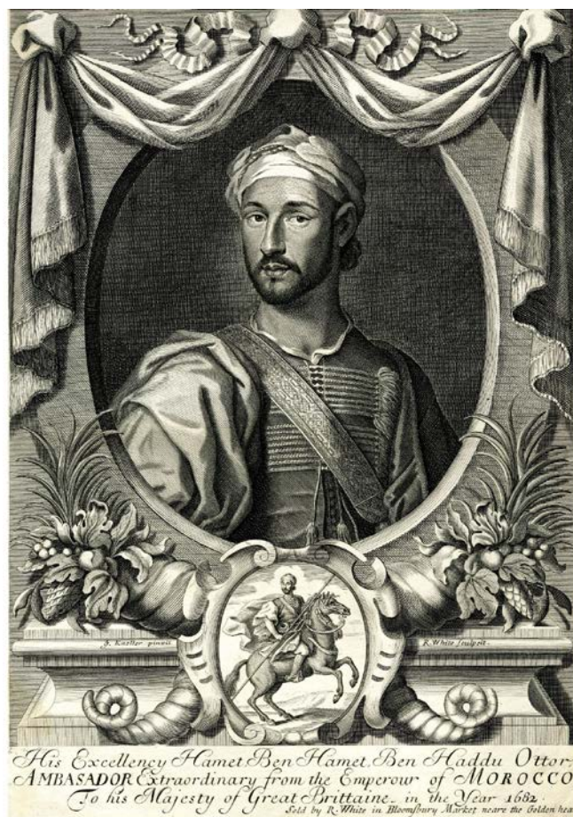
Fig. 3. Engraved portrait of the Moroccan ambassador, Muhammad ibn Haddu, by Robert White after Sir Godfrey Kneller, 1682. British Museum 1849,0315.97.

the séances with spirits of John Dee and Edward Kelly in the Elizabethan period, through the occultist practices of Simon Forman and William Lilly, to reminiscences about their successor Elias Ashmole and other contemporaries of Sloane's who participated in magical rites but whose names are unfortunately not divulged. In the case of Ashmole, it is interesting that Sloane here gives crucial information which Ashmole himself failed to divulge in his autobiographical notes about his encounter with Muhammad ibn Haddu, the Moroccan ambassador who was widely feted when he visited England in 1682, being elected to the Royal Society, having his portrait engraved and being courted by Unitarians who sought irenic links with Islam. 18 In addition to