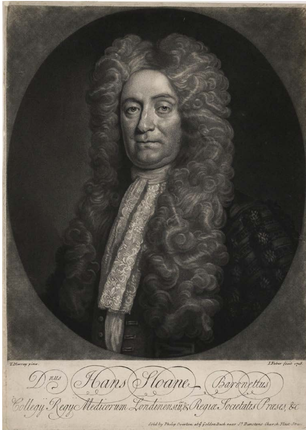
Frontispiece. Mezzotint portrait of Sir Hans Sloane by John Faber jun. after Thomas Murray, 1728. British Museum 1902,1011.1877.