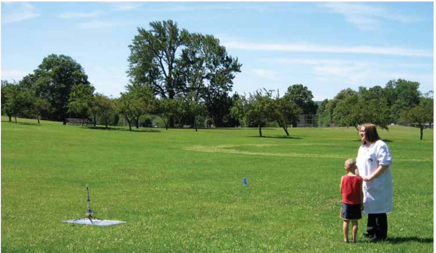
Kids learn about science and rockets at last summer's MetLife Art Adventures class with the Mad Scientist.