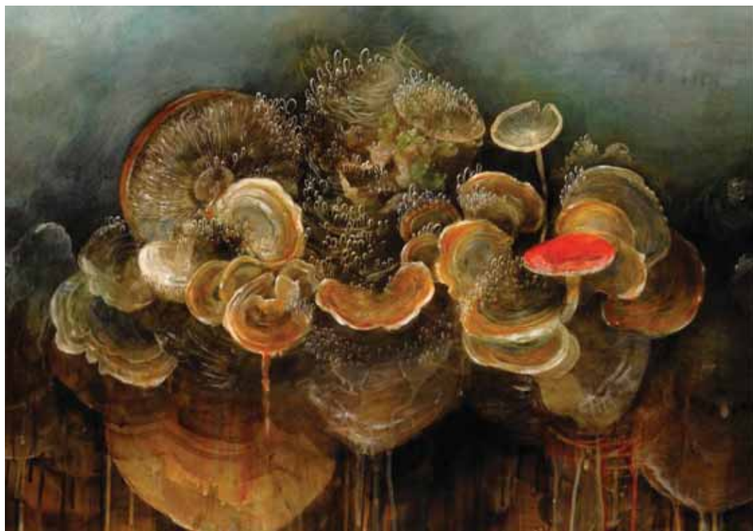
Nicole Duennebier (b. 1983), Undergrowth , 2008, Acrylic on panel, 24 x 36", 2009.45, Charles F. Smith Fund,

Undergrowth , 2008 Acrylic on panel, 24 x 36" Charles F. Smith Fund 2009.45