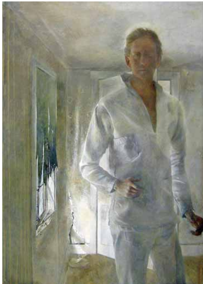
Andrew Wyeth (b. 1917), The Revenant , 1949, Tempera on masonite, 30 x 21", 1952.12, Harriet Russell Stanley Fund

Raphaelle Peale (1774-1825) Bowl of Peaches , 1816 Oil on canvas, 12 5/8 x 19 1/4" Harriet Russell Stanley Fund 1961.01