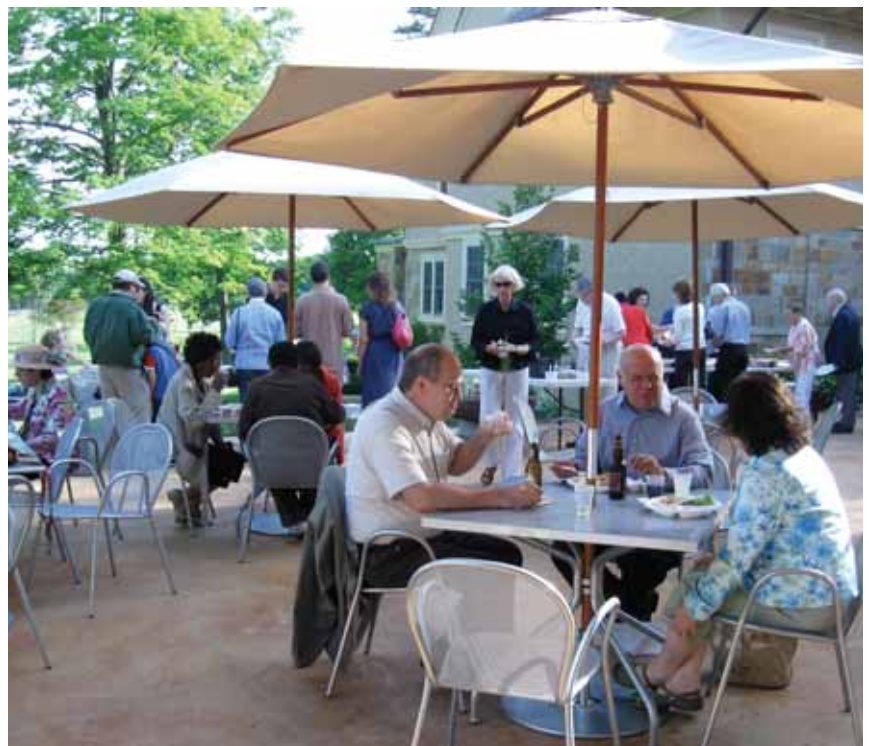
Volunteers enjoy barbecue provided by Black-eyed Sally's in Hartford at the annual Volunteer Picnic.