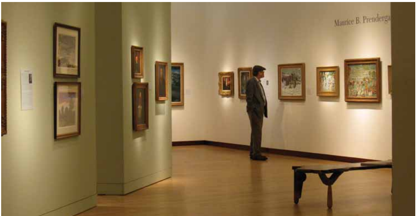
A guest looks over The Eight and American Modernisms at a First Friday