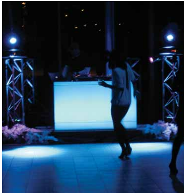
On the dance floor at Museum After Dark.