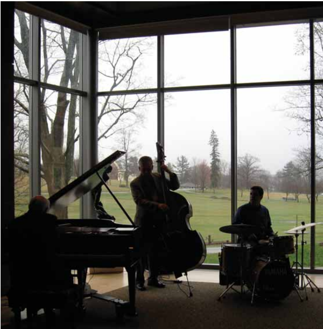
The New England Jazz Trio performed on a rainy April First Friday.