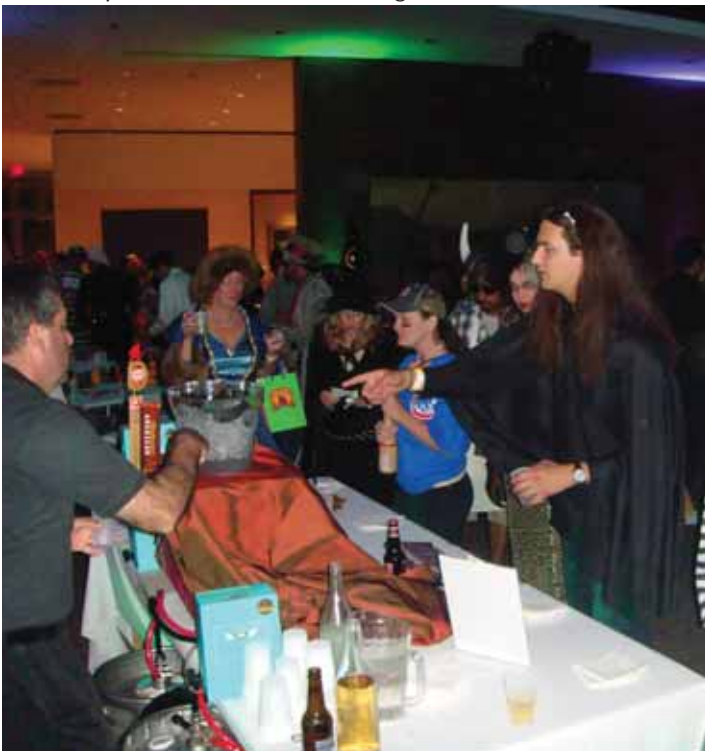
Costumed party-goers await a drink at the wine and beer table at Museum After Dark’s annual Halloween costume party.

On Saturday, May 2, 2009, 366 guests gathered for the Museum’s annual spring fundraising gala – The ART Party of the Year – and what a party it was. According to Krystian von Speidel of the Hartford Advocate,