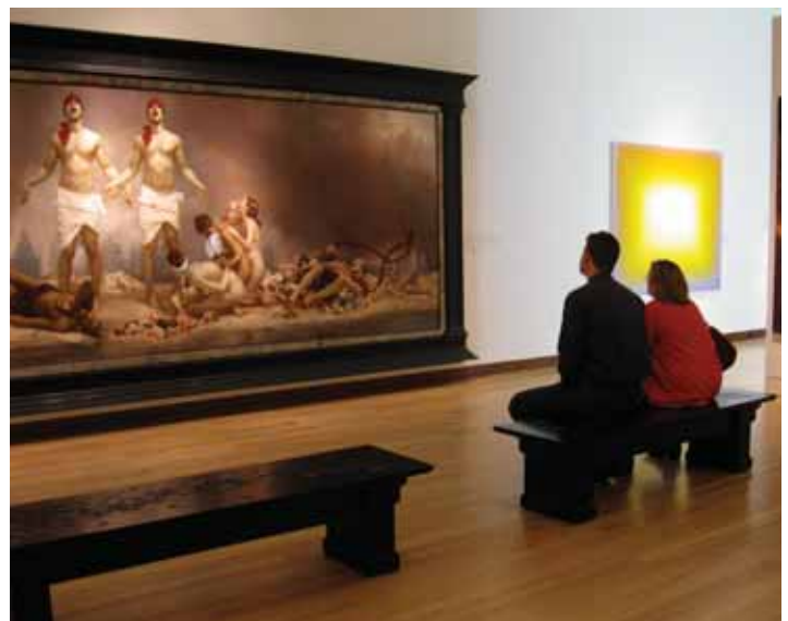
Visitors sit and contemplate Graydon Parrish's allegorical piece The Cycle of Terror and Tragedy , September 11, 2001.