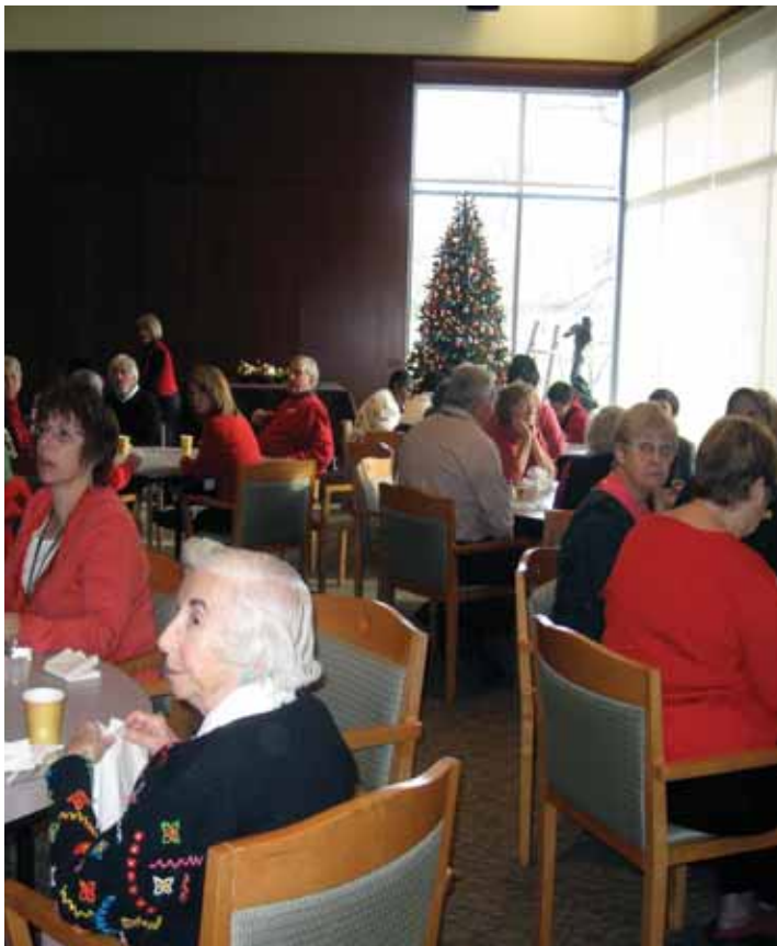
Docents enjoy a pot luck lunch at their annual Holiday Luncheon.