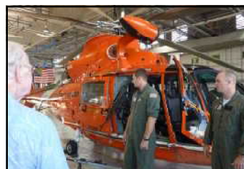
Their motto .. "The Drugs Stop Here."

Our old hanger 67 is now occupied by Boeing for special projects. The hanger was accessible for viewing only and no pictures were allowed inside. Photos could be taken from 20 feet back from the hanger doors.