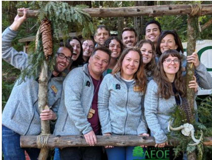
The California Association for Environmental and Outdoor Education Board of Directors-Photo taken March 2019