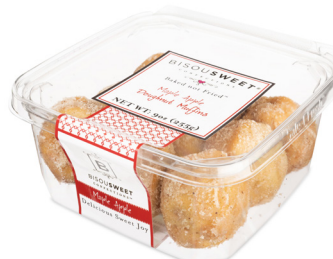
Maple Apple - 9 pack