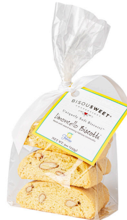
Limoncello - 6 pack