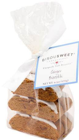
Ginger (Seasonal) - 6 pack