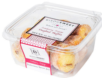
Cranberry Orange (Seasonal) - 9 pack