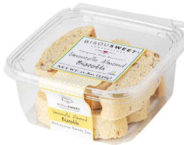
Limoncello Almond - 8 pack