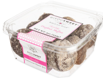
Chocolate - 9 pack