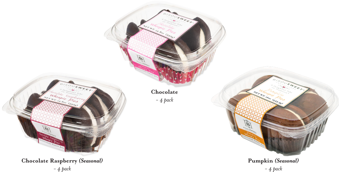
Chocolate Raspberry (Seasonal) - 4 pack

One taste of these & you'll be hooked forever. Each bite takes you back, evoking sweet memories of sunshine and picnics. Each pie is made with our new all-natural cream filling. Our handmade pies are made to be enjoyed with your favorite people.