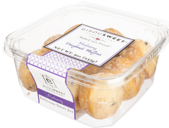
Blueberry (Seasonal) - 9 pack