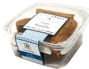
Ginger (Seasonal) - 8 pack