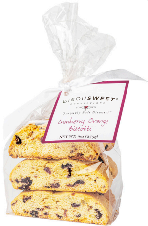
Cranberry Orange - 6 pack