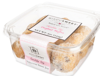
Chocolate Chip - 9 pack