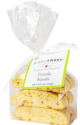
Pistachio - 6 pack