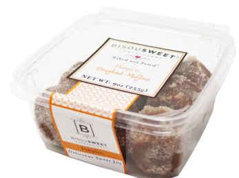
Pumpkin (Seasonal) - 9 pack