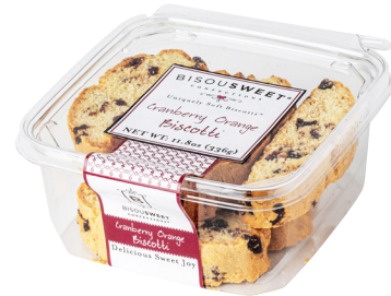
Cranberry Orange - 8 pack