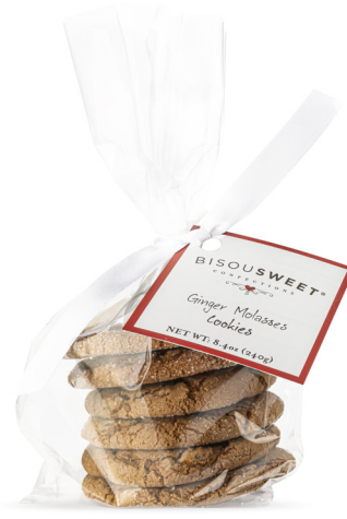
Ginger Molasses Cookies - 6 pack