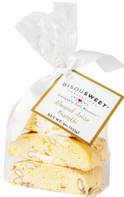
Almond Anise - 6 pack