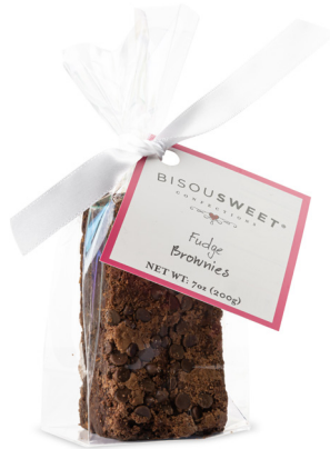
Fudge Brownies - 4 pack