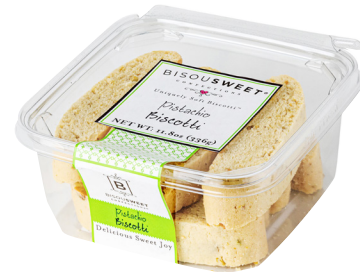
Pistachio - 8 pack