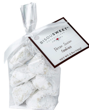
Pecan Susans (Seasonal) - 6 pack