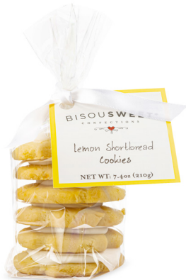
Lemon Shortbread - 6 pack