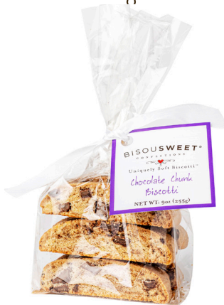
Chocolate Chunk - 6 pack