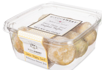
Lemon Poppy Seed (Seasonal) - 9 pack