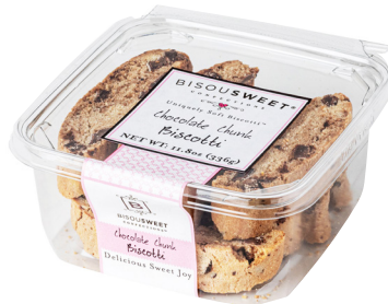
Chocolate Chunk - 8 pack