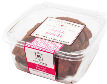
Chocolate - 8 pack