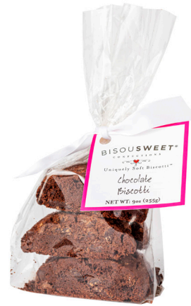
Chocolate - 6 pack