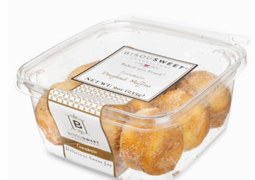
Cinnamon - 9 pack