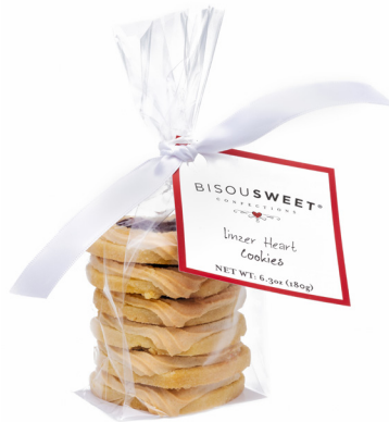
Linzer Hearts - 6 pack